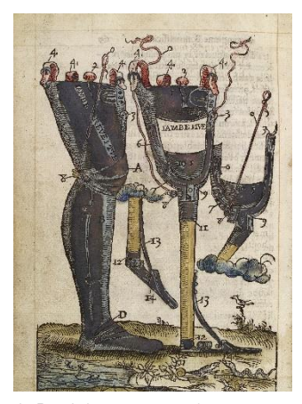
A. Paré, La maniere de traicter les plaies.

which is exceptional for a humanities monograph.<sup>2</sup> Surgery and Selfhood has reached a far wider audience than would otherwise have been the case, with over 1,700 readers in 3 months.