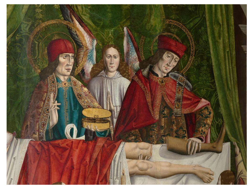
Detail from A verger's dream: Saints Cosmas and Damian performing a miraculous cure by transplantation of a leg. Attributed to the Master of Los Balbases, ca. 1495.

Surgery and Selfhood in Early Modern England: Altered Bodies and Contexts of Identity<sup>1</sup> is an Open Access monograph published in 2021. It is the product of a Wellcome Trust-funded postdoctoral fellowship (2016-2019), which investigated what happened to people of the period 1550-1750 when they experienced life-changing surgeries such as amputation, mastectomy, or facial surgery. This work draws on historical, medical and literary texts. It provides valuable new interpretations and collations of historical material, including the first examination of phantom limb syndrome in this period and the first analysis of representations of early mastectomy survivors.