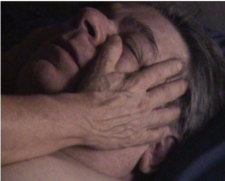
Sequence of soothing touch, Stephen Dwoskin (dir.), Intoxicated by My Illness , 2001.