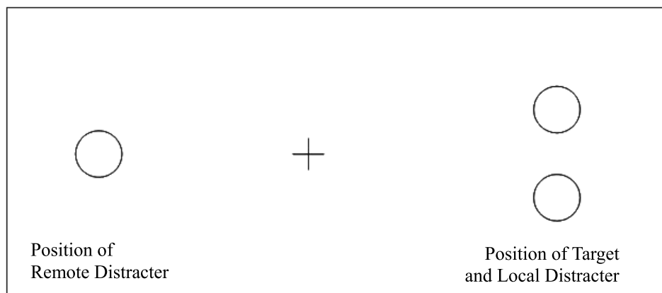
Figure 1. Targets were restricted to appear on the right or left hand side of the screen for two separate groups of four observers. In the example display shown, the target appears on the right, 10 deg of visual angle from fixation, at an angular offset of 10 deg above or below the horizontal meridian. A distracter, local to the target, also appears on the right in the mirror-opposite place to the target across the horizontal meridian. In 50% of trials a further, remote, distracter will appear to the left of fixation, on the horizontal meridian 10 deg of visual angle from fixation.

Stimuli were presented 8 deg of visual angle from fixation at an angular offset of 10 deg (see figure 1 for an example with targets shown to the right of fixation). A target and distracter were always present in one of two possible locations: 10 deg above horizontal or 10 deg below (eg if the target appeared above then the distracter was in the down position and vice versa). In the opposite hemifield a single remote distracter was present on half of the trials. This appeared on the horizontal meridian, 4 deg from fixation. Distracters and target stimuli appeared simultaneously. For half of the observers (four) the target appeared only on the left while the remaining half saw targets only on the right. The fixation spot was removed from the display either before (gap, denoted by negative numbers) or after (overlap) target onset at stimulus onset asynchronies (SOAs) of -150 , -75 , 75 , or 150 ms relative to target onset. For each SOA there were 4 conditions: 2 possible target/distracter positions (10 deg above or below the horizontal meridian) and 2 possible remote distracter states (absent or present). Observers completed 2 blocks of 80 trials, producing a total of 160 trials (10 trials per condition) each.