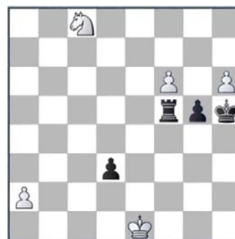
db#5,119: G. Petenyi (1908) Az Ujsag

Hoch intended the solution 1.Rc4 b2 2.Ra4+ Kb3 3.Nc5+ Kc3 followed by 4.Ra3+ Kc2 5.Na4! b1Q 6.Rc3 mate. However, the study-like 4.Ne4+! wins even more quickly: 4...Kb3 5.Rd4 and now, with the bK at b3, the promotions b1Q/R/B fail to the forking check Nd2+ : 4...b1N also fails to 5.Kd3 h2 6.Nc5+ . Villani intended the solution 1.Rh8 Nxh8 2.Rxa2 and now the presence of bNh8 seems to prevent 2...h1Q+ 3.Kg3 and Black is unable to cover a1. Therefore the composer proposed 2...h1N 3.Rg2+ Kf1 4.Rh2 Kg1 5.Rxh8 Nf2 6.Ra8 Nd3 7.Ke3 wins. But 2...h1Q+ 3.Kg3 and now 3...Kf1 4.Ra1+ Ke2 5.Rxh1 Nf7 draws. This means that 2...h1R and 2...h1B also draw, i.e., every promotion draws except the one the composer used! Lastly, Petenyi intended 1.Ne7! Rxf6 2.h7 Rh6 3.Ng8! Rxh7 3.Nf6+ Kg6 5.Nxh7 followed by 5...Kxh7 6.Kd2! Kg6 7.a4 g4 8.Kxd3 Kf5 9.a5 winning. However, Black has the win: 5...g4! 6.Nf8+ Kf5 7.Kd2 (or 7.Nd7) 7...g3!