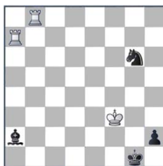
db#22,772: V. Villani (1947) L'Italia scacchistica