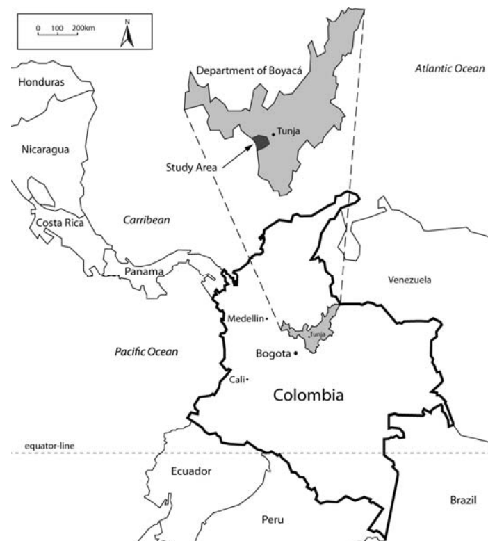
Figure 1. Study area (Oehler, 2008)

The study area consisted of four veredas (communities) located in the Department of Boyacá, on the eastern chain of the Colombian Andes (Figure 1). It is a rural region mainly devoted to the cultivation of potato (although carrots, maize, wheat, beans, and oats are other relevant crops) (Ministerio de Agricultura y Desarrollo Rural, 2006).