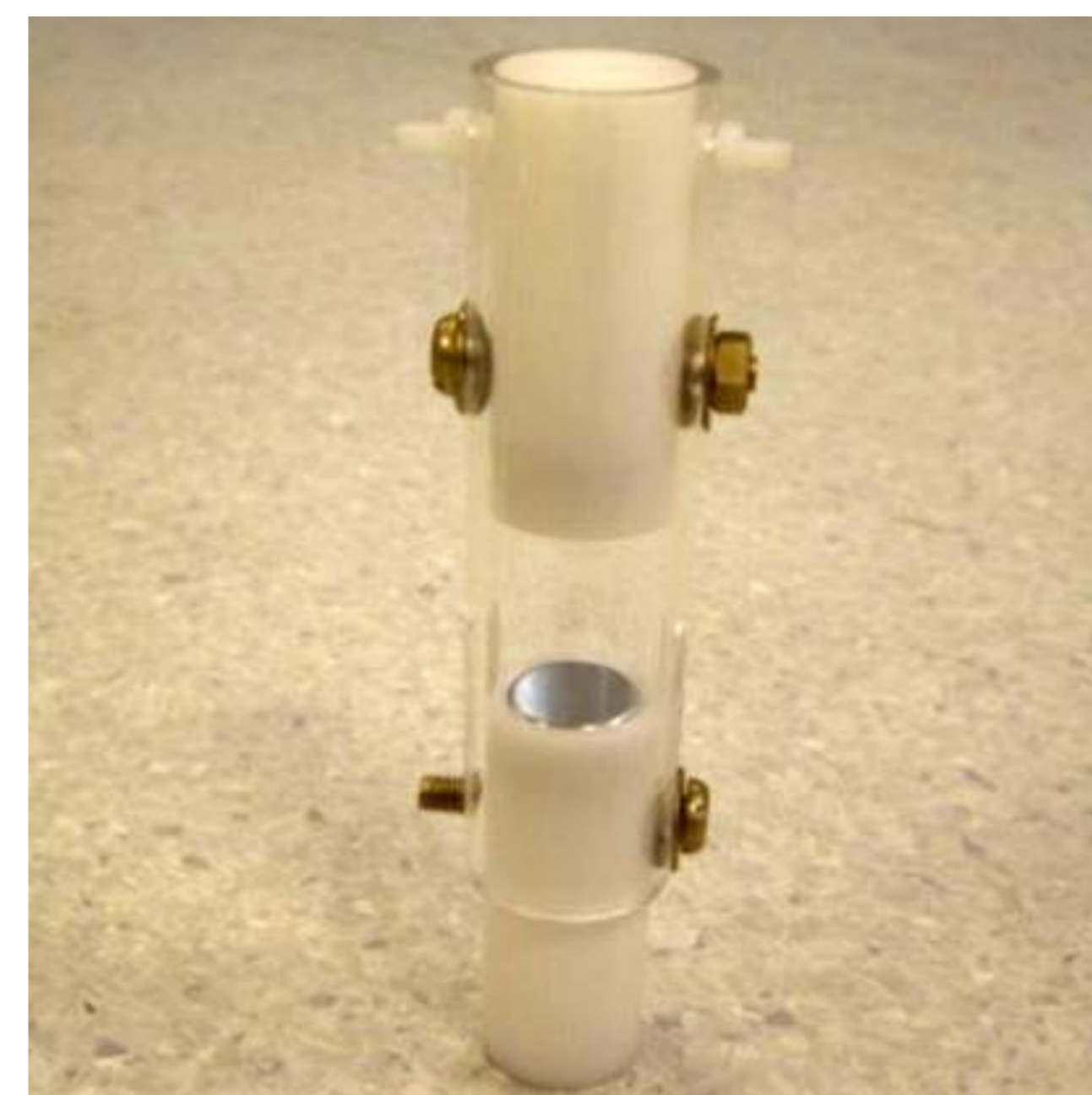
Figure 3: Prototype DMCU assembled

The prototype design uses two N42 Grade Neodymium magnets with a radius and thickness of 10mm. These magnets were chosen as they had a resting separation of 50mm whilst still being able to support a maximum load of 10kg. The materials used for construction of the DMCU are clear acrylic plastic and Delrin, as these materials satisfied all the design constraints whilst not affecting the magnetic fields of the two magnets housed within the DMCU. The prototype DMCU is shown in Figure 3.