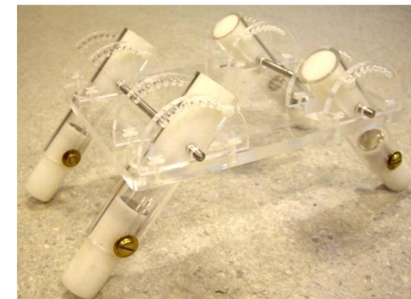
Figure 4: DMCU Robot Test Rig with 4 DMCU modules

A simple 4-wheeled test rig incorporating 4 compliance units was also designed to use 4 of the DMCU modules. The test rig allows each leg to be adjusted so that the angle of attack is locked between \pm 45^\circ from vertical and is made from the same materials as the DMCU. Figure 4 shows the test rig including 4 DMCU modules, without the wheels mounted. This test rig will be used for future testing, and is currently having the measurement electronics installed. These measurement devices will help evaluate the model.