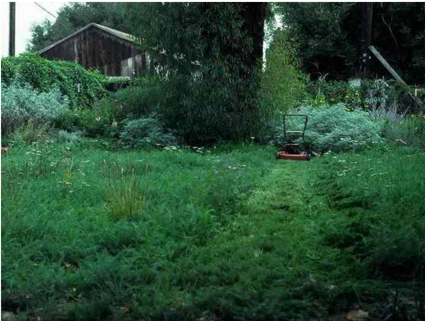
Figure 4. Selfheal lawn in spring. Courtesy: Hugh J Prichard (2010)