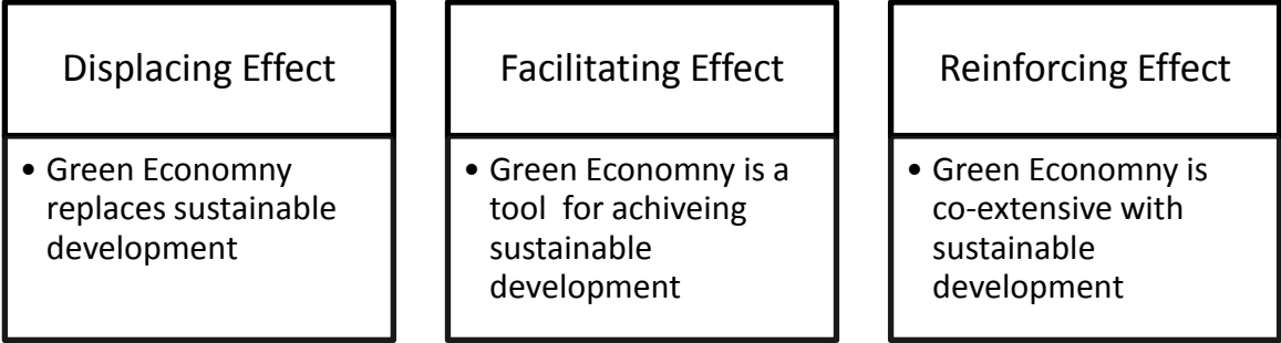
Fig. 2 Green Economy’s relationship with Sustainable Development

again there are at least three distinct if sometimes overlapping classes. First, some have suggested that sustainable development is too broad and difficult to operationalize. Here, the green economy is hailed as a needed replacement. As the argument goes, green economy has the virtue of parsimony because it allows policymakers to focus on the economic pillar of sustainability (Borel-Saladin and Turok 2013: 213). In this view, green economy—with encouragement and sponsorship—can bring about needed change. In any event and pragmatically speaking, framing sustainability in the context of economic growth simply makes more sense post-crisis, eliciting broader support than demands for radical-only change. Thus green economy “is currently the most effective strategy for beginning to foster greater understanding and appreciation for the environmental and social problems facing us” (ibid: 218).