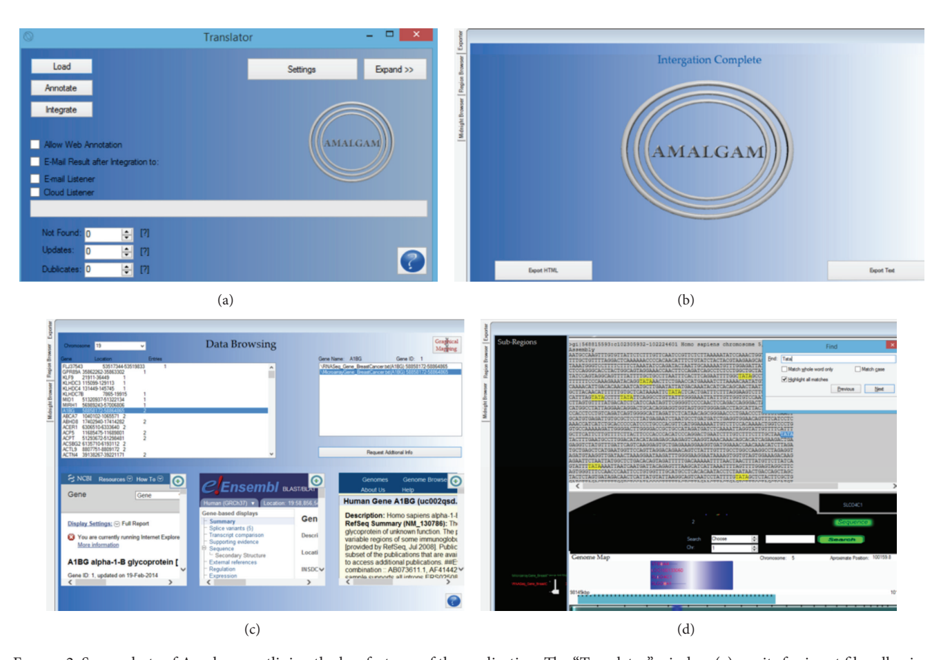
FIGURE 2: Screenshots of Amalgam outlining the key features of the application. The "Translator" window (a) awaits for input files allowing users to upload text annotation or data files. When merging is complete, the output files can be downloaded by the "Integrator" tab page (b). The output merged files can be displayed in the two browsing windows. Particularly, genomic features, such as gene names and chromosomal positions, are extracted from the text files and are displayed in the "RegionBrowser" tab page (c). For each identified region, gene related information can be displayed from well-known public databases. In the "Midnight Viewer" tab page (d), the merged data are displayed on chromosomal or genome maps.