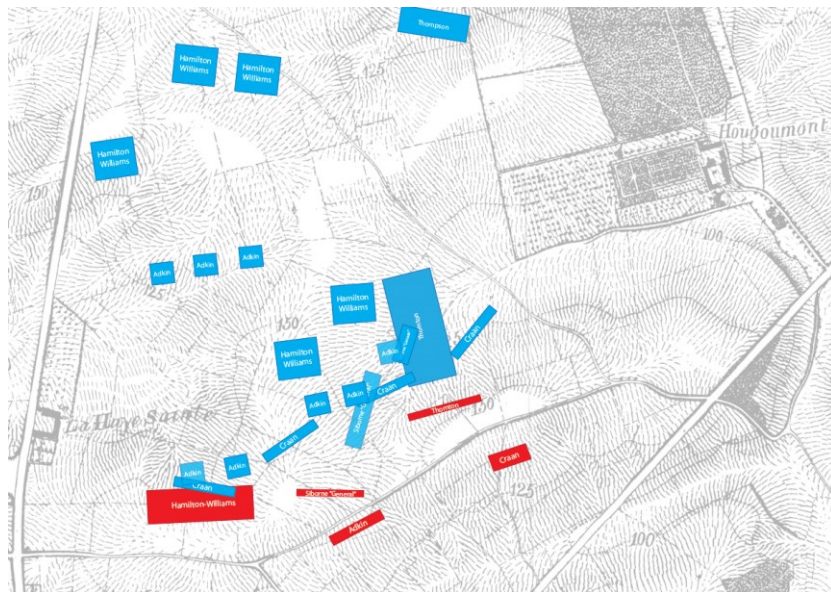
Figure 1: Locations and unit sizes of the 311 st Foot Guards and Imperial Guard from different authors plotted on Siborne's map.

from those same maps. It is possible to see the wide variation not only in location but in size and direction of movement (see Figure 1).