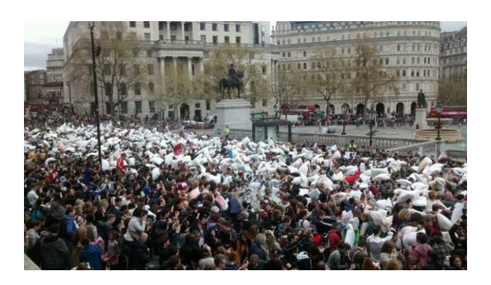
Excerpt 7.7 International pillow fight day

Well, well, jolly good! You thickies, you, you, and you! The second I left (my city), you were having a wild party! Pillow fight [...] (Blog post, April, 2014)