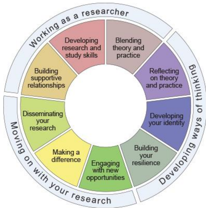
Figure 2: The Researching Practitioner Development Framework