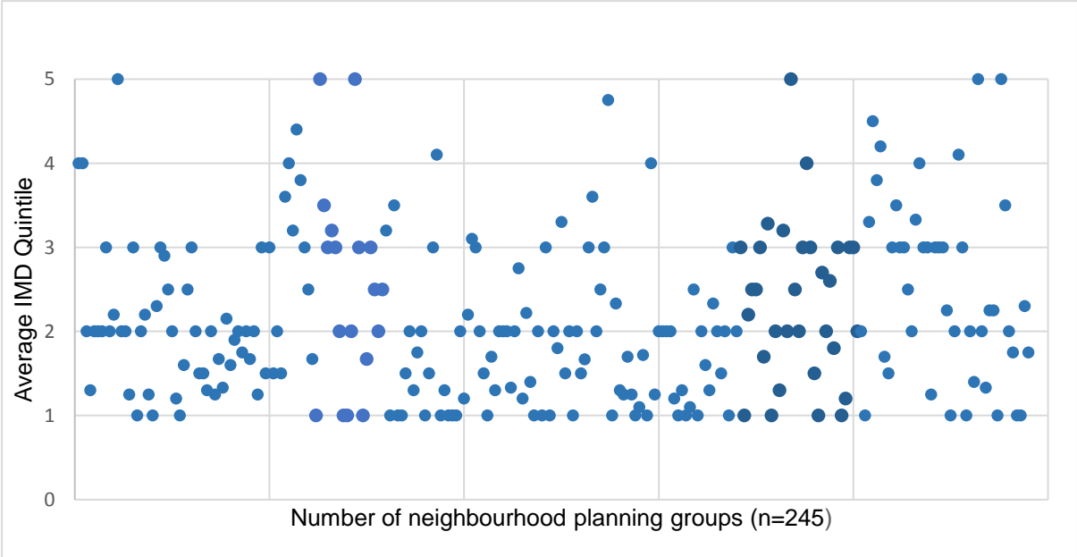
Figure 4: Index of Multiple Deprivation Breakdown of Neighbourhood Planning Areas who had passed the referendum (based on LSOA, October 2016)

(Note: based on 2015 IMD classifications and ONS 2013 population projections. Q1 = least deprived / Q5 = most deprived)