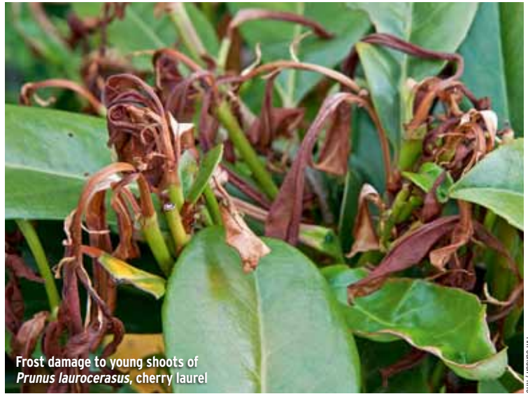
Frost damage to young shoots of Prunus laurocerasus , cherry laurel

These changes in lipid composition are, however, very sensitive to prevailing temperature. A short period of higher temperature, for instance in late autumn, may reverse acclimatization and break dormancy. This frequently results in increased winter damage when colder conditions return (Kuroda et al. 1993). Once cooler conditions return, the structure of the membrane lipids reverts to that which is suited to colder conditions (Dixon & Biggs 1996). Similar results have been reported by Liu et al. (2011) who studied the relationship