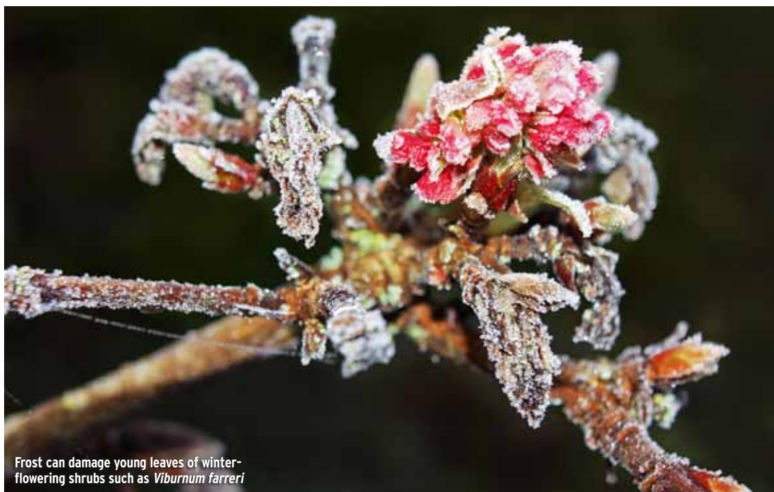
Frost can damage young leaves of winter-flowering shrubs such as Viburnum farreri