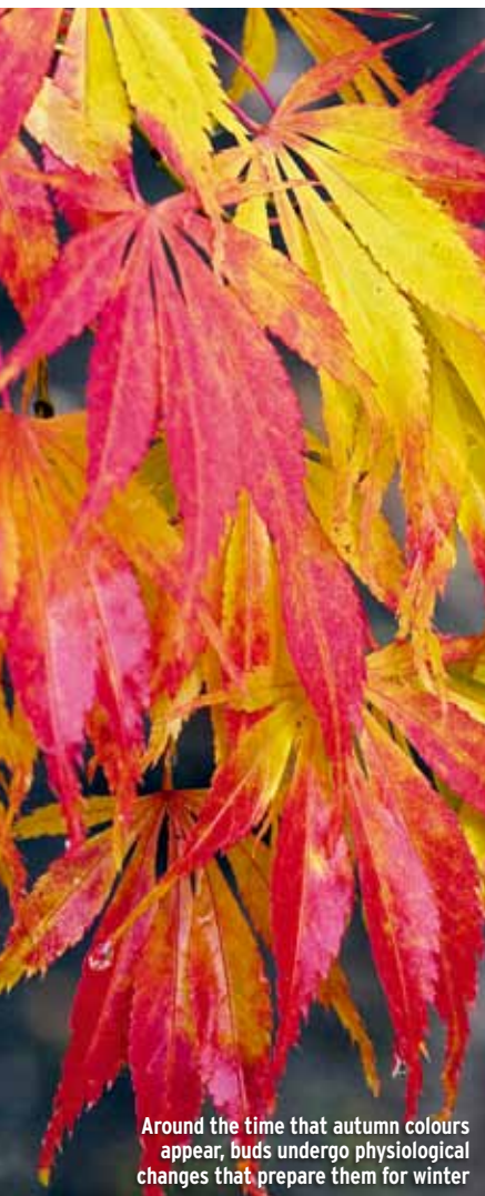
Around the time that autumn colours appear, buds undergo physiological changes that prepare them for winter