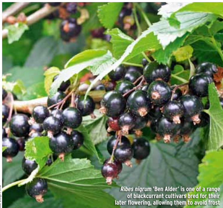
Ribes nigrum 'Ben Alder' is one of a range of blackcurrant cultivars bred for their later flowering, allowing them to avoid frost