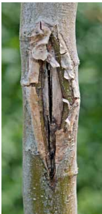
Cold injury can lead to stem splitting

Symptoms of cold injury are made worse by frozen soil which leads to water shortage both at plant roots and in transpiration streams. Injury is compounded further by desiccation from cold winds and scorching from the intense sunlight of bright,