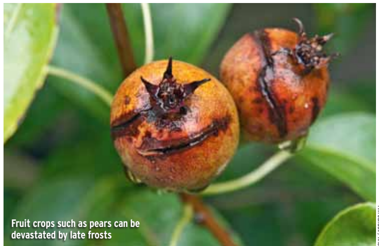
Fruit crops such as pears can be devastated by late frosts