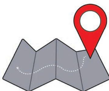
Look at map