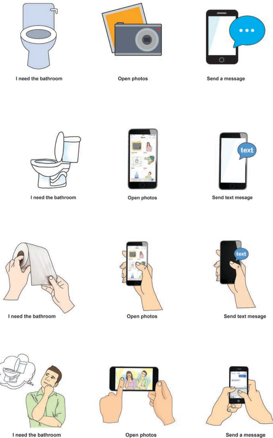
Figure 2: The changes in visual variation applied to the test materials: (a) object in icon style, (b) object in naturalistic style, (c) hand holding object, and (d) object shown in context.

The only exception was the presentation of "I love you" (Figure 3), which was kept consistent in icon style across the conditions given its more abstract meaning. As a frequent phrase that was likely to be used in the resources developed as part of the wider study, our team decided it was important to include this in the materials even though it was going to be controlled across all conditions.