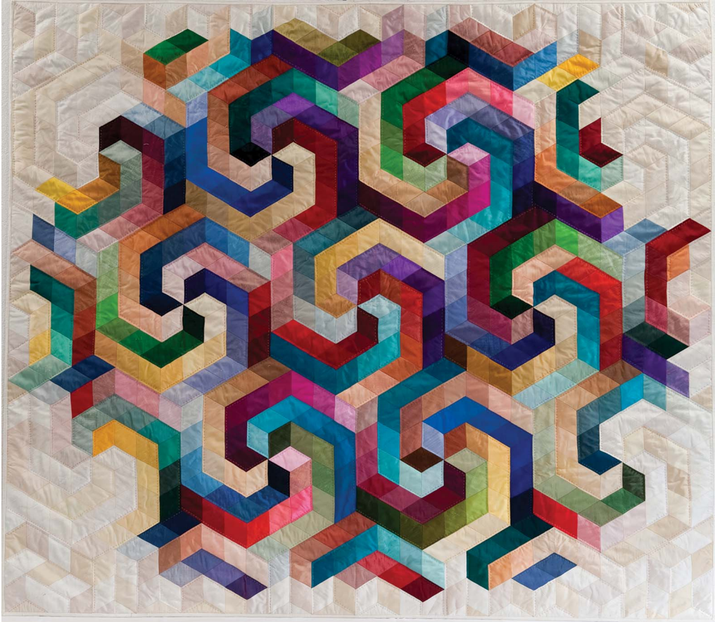
Figure 8. Imagining the past as a textile: 'Entwined'.

choosing a particular interpretative approach. The lack of reflection given to the author's personal perspective in many archaeological studies is a core issue in how structural inequalities endure, including the perpetuation of patriarchal approaches. Discrimination today based on sex, gender or sexual orientation is intrinsically linked to the paucity of research on gender in the past. To combat this, we must all demonstrate who we are and why we 'do' our studies in our own particular way. To paraphrase Virginia Woolf, this means changing and adapting, re-arranging our rooms (physical, literal and digital) to encourage other people to take up and redefine that space in order to enable a diverse, multi-vocal archaeology.