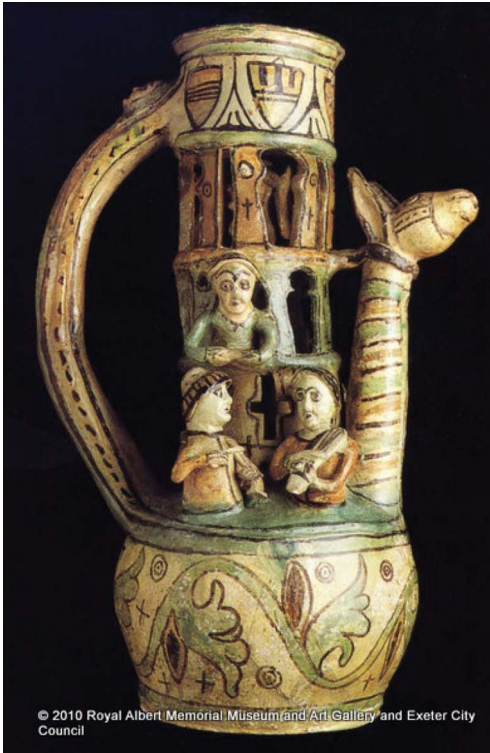
Figure 7. Exeter puzzle jug.