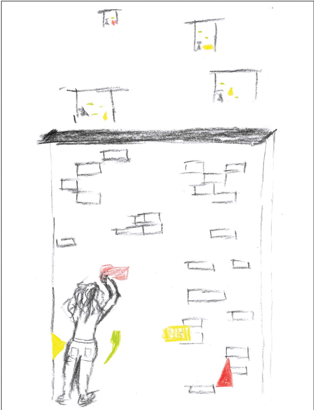
Figure 3. 'Filling in the gaps': an outdated approach (image by the author).

gendered roles and other aspects of their identities involving ethnicity, sexuality and age. Awareness of this is evidenced by examples of gendered archaeologies (e.g. Tringham 1991; Gilchrist 1999; Sørensen 2000; Brück 2009), as well as archaeologies of sexuality