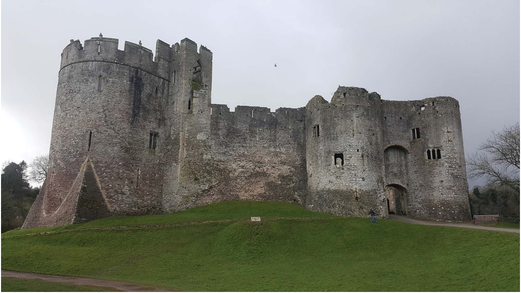
Figure 4. Chepstow Castle in Wales.

These disciplines, however, still show an explicit awareness of the complex ways in which medieval people constructed their identities. This has resulted in innovative explorations of sexuality, the body, gendered identities, queerness and, of course, women and feminist activism (e.g. Green 2008; L'Estrange 2008; French 2013; Maude 2014; Moss 2018).