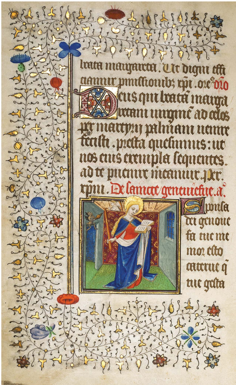
Figure 5. Detail of St Genevieve in MS 2087 Book of Hours.