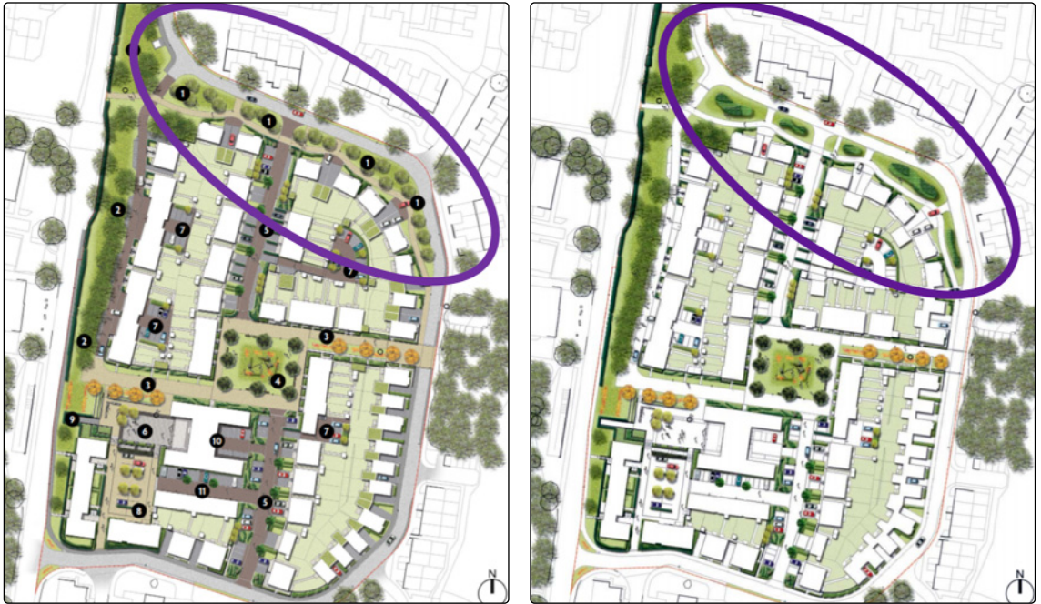
Fig. 3 Pedestrian character area (Rural-urban extension 2) with trees (2014, left) and trees removed when utilities were redesigned (2015, right)

were heavily 'front-loaded', conducted early during the outline design stage and driven by planning rules and norms. During the later detailed design and construction stages, however, GI-related evaluations were conducted more intermittently. They were also often conducted by consultants peripheral to the core design team, which, in turn, weakened the evaluative accountability of central decision-makers at the latter stages. For example, a landscape architect (at Infill 2) described how the design team seemed unaware of the evaluative recommendations that had arisen from an earlier ecology survey: