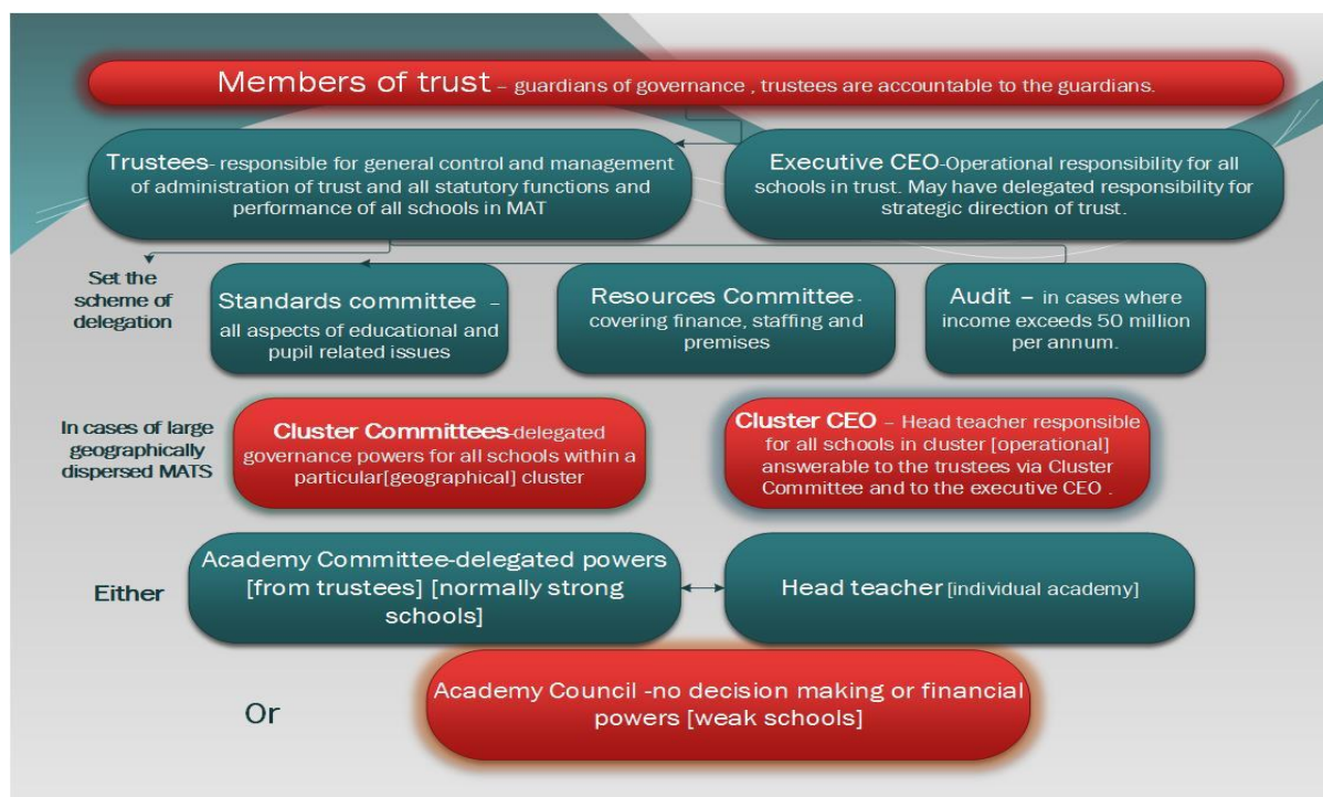
Figure 1 adapted from Baxter 2018