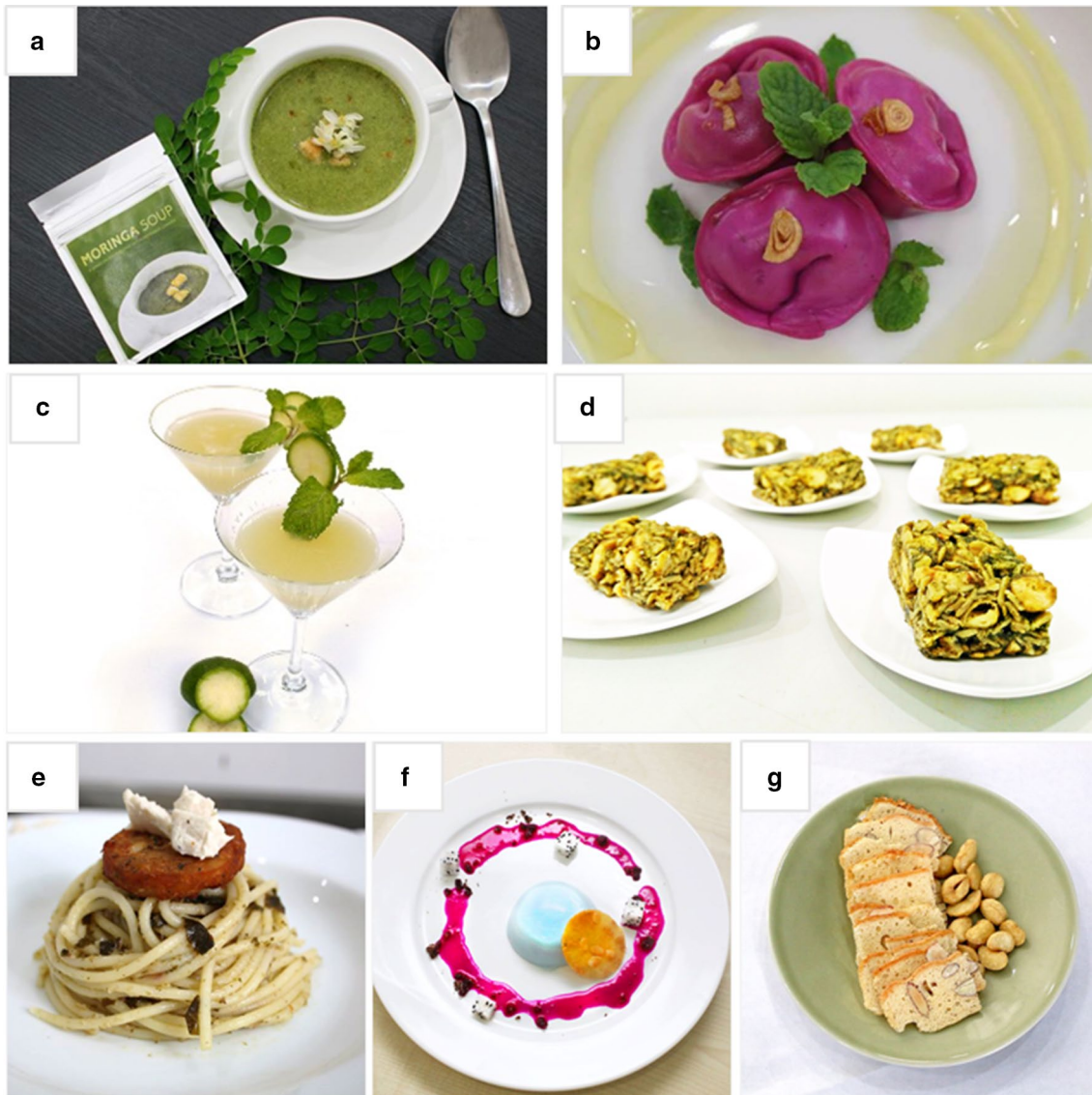
Fig. 2 Food and beverage products developed at CFF using moringa, Bambara groundnut, dragon fruit and kedondong fruit. a Moringa instant soup, b Dragon fruit tortellini with beans and greens, c

Kedondong ginger ale, d Moringa and Bambara groundnut granola bar, e Bambara groundnut noodle, f Bambara groundnut panacotta and g Bambara groundnut biscotti