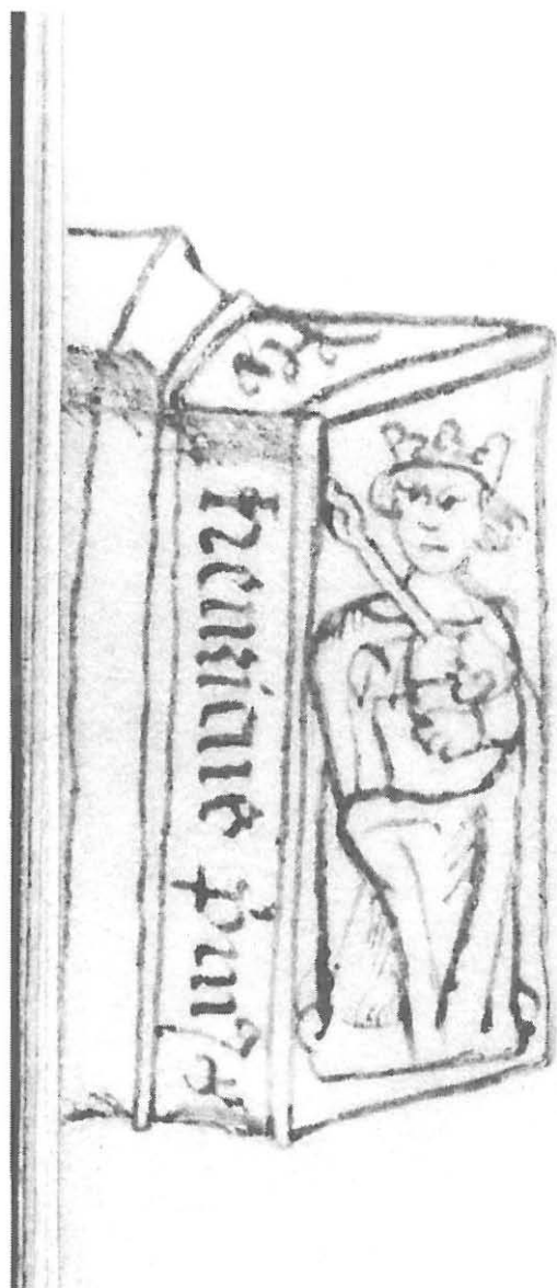
Fig. 1. Marginal illustration possibly representing the tomb of King Henry I at Reading Abbey in British Library Ms. Royal 20 A XVIII, fol. 172r. (Reproduced by permission.)