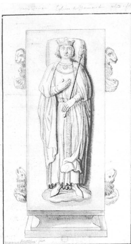
TOMBEAU de pierre à gauche en entrant par la petite porte dans l'Eglise de St. D. de Rouen.