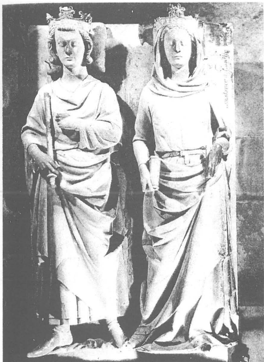
Fig. 4. Effigies of Philippe, son of King Louis VI of France, and Constance of Castile at St-Denis.