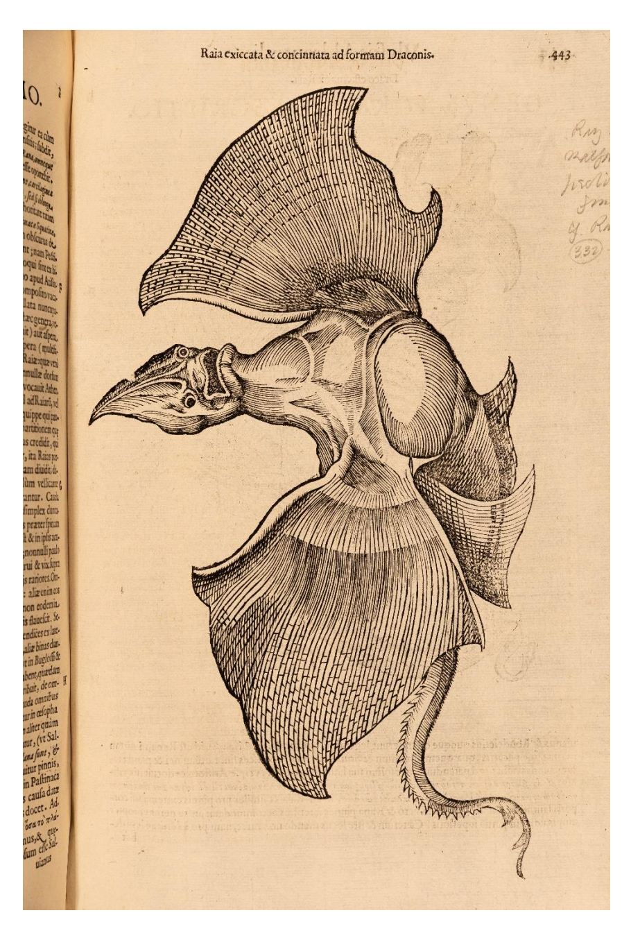
Figure 5. Aldrovandi, U. 1613. Vlyssis Aldrovandi philosophi et medici Bononiensis de piscibvs libri V et de cetis lib. Vnvs . Bonn: Apud Bellagambam.