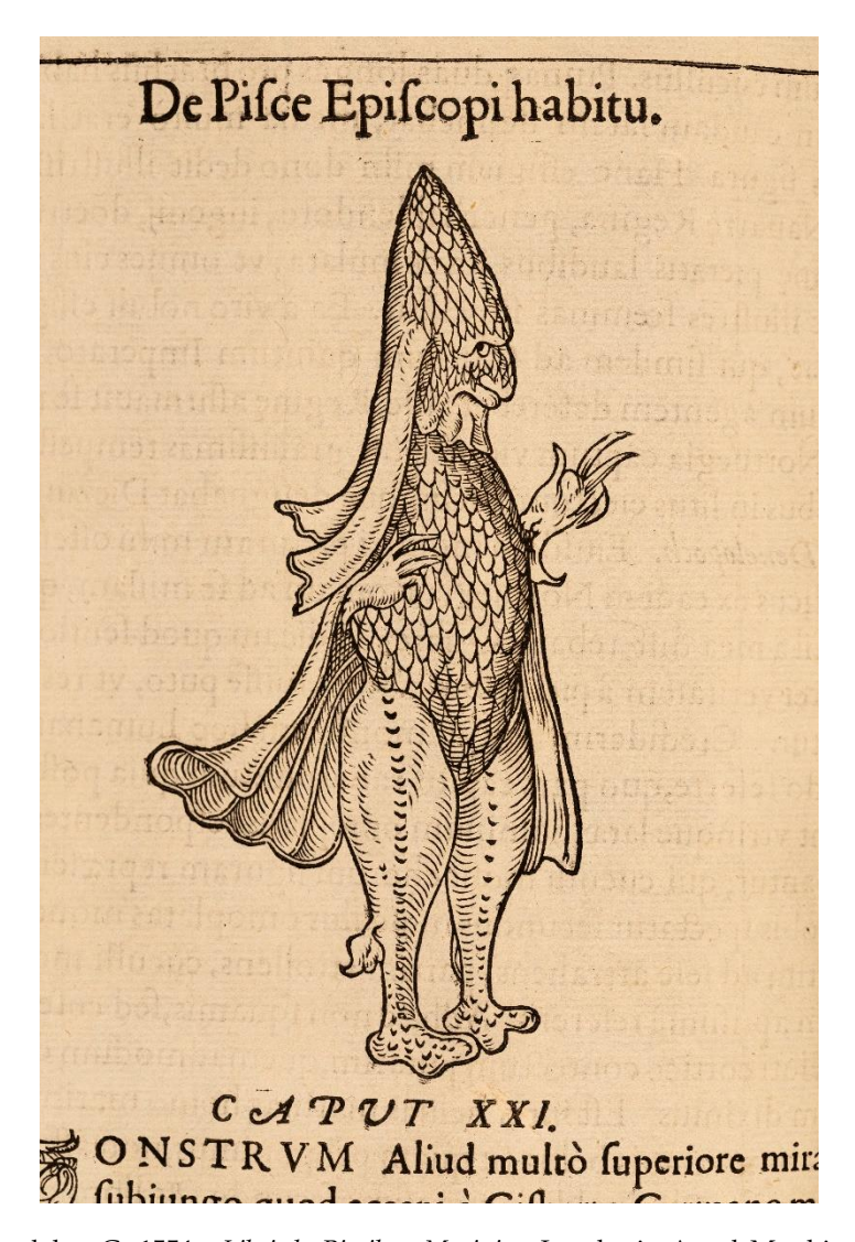
Figure 3. Rondelet, G. 1554. Libri de Piscibus Marinis. Lugduni: Apud Matthiam Bonhomme.