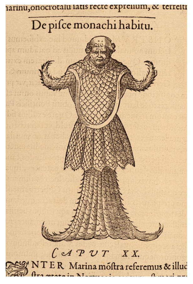
Figure 2. Rondelet, G. 1554. Libri de Piscibus Marinis. Lugduni: Apud Matthiam Bonhomme.