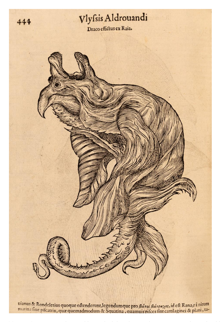
Figure 6. Aldrovandi, U. 1613. Vlyssis Aldrovandi philosophi et medici Bononiensis de piscibvs libri V et de cetis lib. Vnvs. Bonn: Apud Bellagambam.