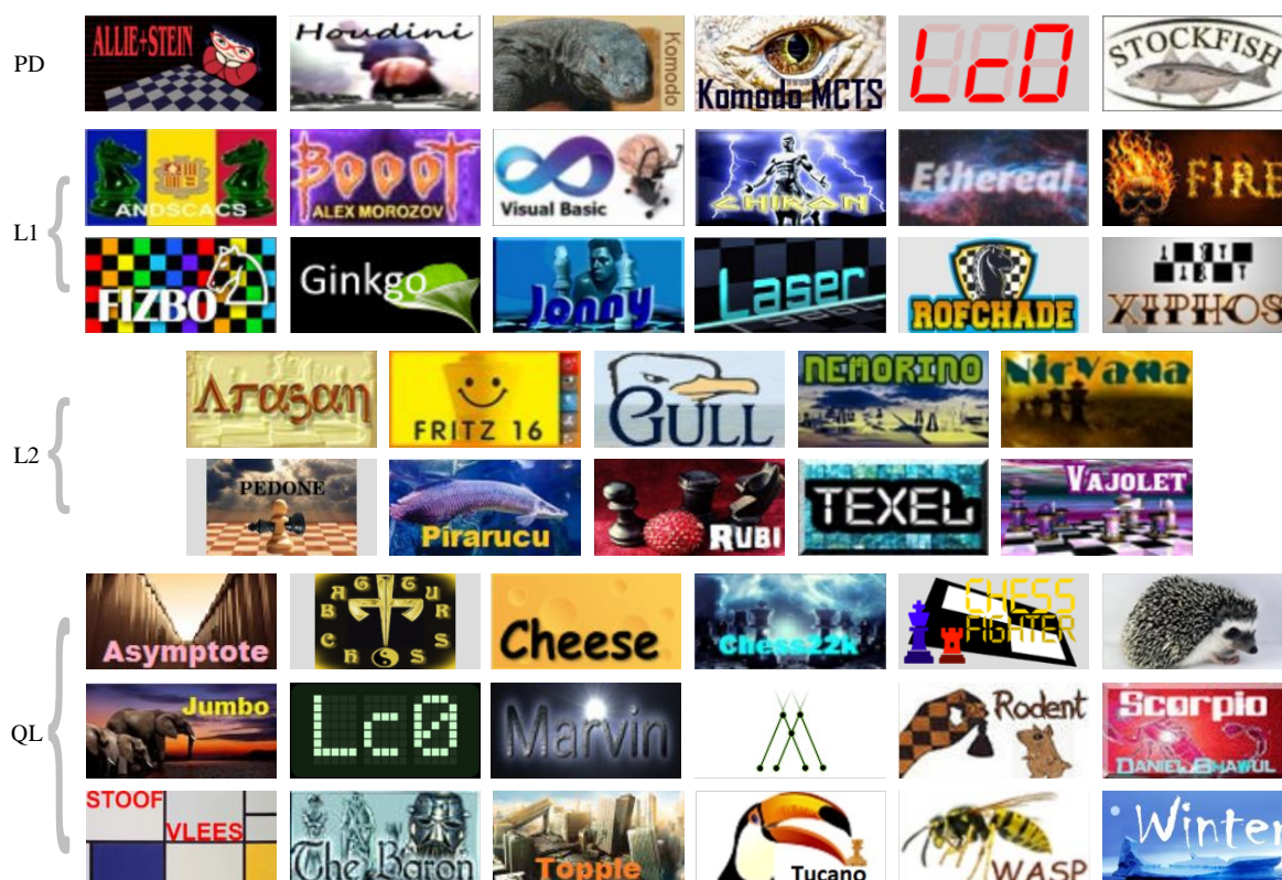
Fig. 1. Logos for the TCEC 16 engines (CPW, 2019) as in their original leagues and divisions.

TCEC Season 16 started on July 14 th 2019 with a revised structure as active engine authors are forming a longer queue to join the action. ‘Divisions’ are now ‘leagues’: divisions 4 and 3 were replaced by a larger Qualification League. Leagues 1 and 2 with 16-18 engines were double the size of their predecessors. Fig. 1 and Table 1 provide the logos and details on the enlarged field of 46 engines. Elo figures seem to be getting higher but it is of course only the Elo differences that are significant.