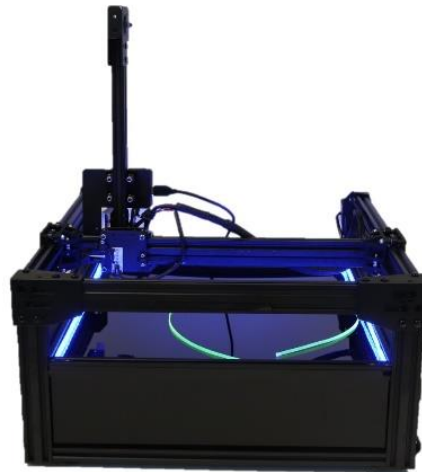
The assembled imaging robot.

Our Biomedical Technology Lab builds simple low-cost solutions for current and future healthcare problems. These include point-of-care bioassay devices to test for antimicrobial resistance and help tackle antibiotic overuse. Traditional microbiology methods are slow, so we developed a smaller and faster version using microcapillary films where visual cues, such as colour changes, could detect bacterial growth. Because these films cannot be imaged by commercially available readers, we built our own imaging system using the frame of a 3D printer as the base. Our aim was to create a solution that was accessible for other researchers wanting to implement similar systems, and adaptable to a wide range of imaging requirements.