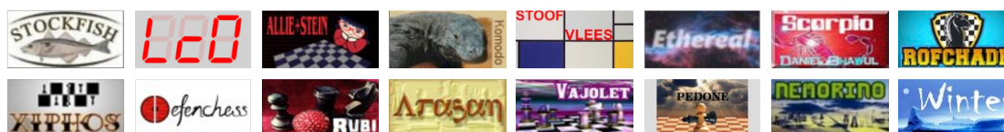
Fig. 1. Logos for the TCEC Cup engines in seeded order (STOCKFISH → LEELA CHESS ZERO → ... → WINTER).

Some of the 'top 16' engine authors took a break at this point. FIRE, KOMODOMCTS, HOUDINI, ANDSCACS and LASER were not entered in the lists, making way for ARASAN, VAJOLET2, PEDONE, NEMORINO and WINTER. Engine versions and nominal Elo figures did not change between rounds. Engine details are available elsewhere (CPW, 2020; Haworth and Hernandez, 2020a) but their logos in seed order are listed here in Fig. 1.