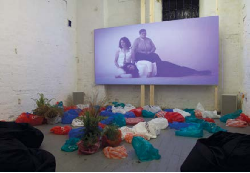
Rory Pilgrim, Software Garden (2018), installation view in (Un)Commoning Voices and (Non)Communal Bodies , exhibition at Open Hand Open Space, Reading International, UK, 2019

of collective voices remains a spiritual experience for Pilgrim; however, it gains a reflexive, critical depth through the joint narrative of the collaborators.