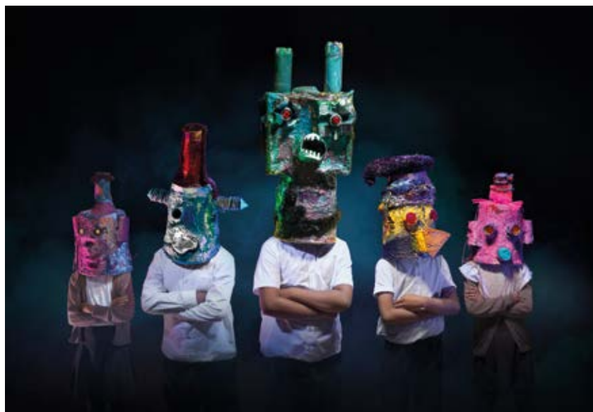
Mikhaïl Karikis, No Ordinary Protest (2018), production photo

process aimed to reflect the environmental crisis and the role of noise in protest. They improvised vocally with musical instruments, toys, and masks, spoke and listened to each other, and imagined how noise and voice could take up visual forms similar to the changing landscape. In the story, a female superhero gifts children with the power of noise, and the gift is transmitted further by touch, resonating the collective call of creatures affected by the pollution of the planet. In solidarity with the creatures, the children infiltrate factories and ‘infect’ adults with their demand for action. Again, looking at this work from a post-Covid-19 perspective, it gains a new chilling perspective. With regard to LaBelle’s theory, this work relates to the non-verbal utterings described by LaBelle and the expanded realm of what he calls the Oral Imaginary, or “the poetics of an experimental orality,” 48 as well as the relation between the voice and the body and the individual and collective, through the concept of “infecting” each other with the power to speak. 49