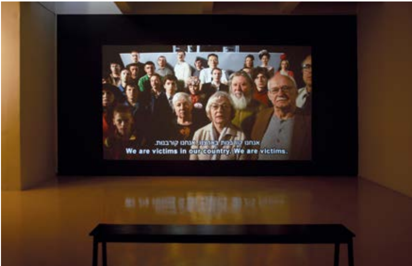
Chito Delat, A Tower: The Songspiel (2010), installation view in Preaching to the Choir , Herzlyia Museum, Israel, 2015, curator: Maayan Sheleff