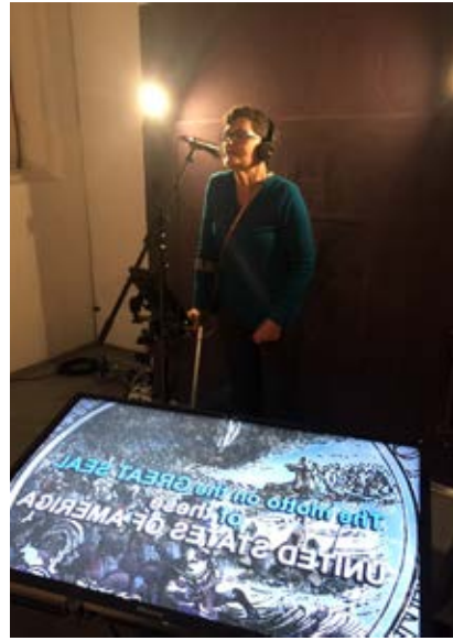
Tali Keren, The Great Seal (2017), installation view in (Un)Commoning Voices and (Non)Communal Bodies , exhibition at Open Hand Open Space, Reading International, UK, 2019

Washington, DC Summit of Christians United for Israel (CUFI) and assume the role of keynote speaker. CUFI mobilises millions of American Evangelical conservatives who view Jewish rule over the land of Israel and the occupied territories with Palestinian self-governance as a precondition for Christ's Second Coming and the imminent Battle of Armageddon. By using a presidential teleprompter and a karaoke "sing-along" machine, participants are invited to perform speeches compiled from those delivered at past CUFI summits. By assuming the role of the preacher, the participants are confronted with the power of public speaking. 71 The work was shot and completed in 2015, before Brexit and the Trump presidency, thus it is somewhat prophetic in shedding light on the power of populism and propaganda and their role in the development of isolationism and nationalistic sentiments.