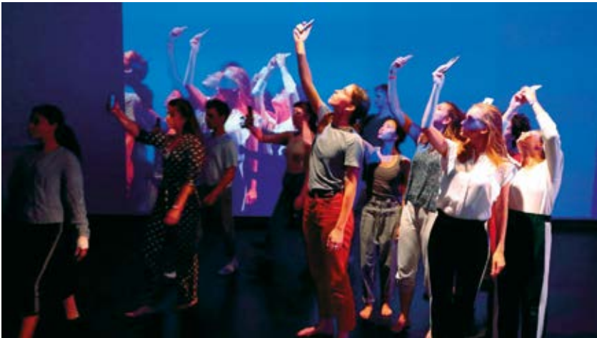
Rory Pilgrim, Software Garden (2018), stills from video