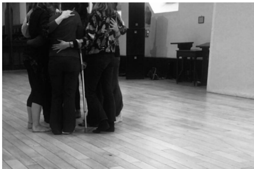
Michal Oppenheim (2019), workshop series photos, ChorUs: Voice Lab for Women , Saint Laurence Church as part of (Un)Commoning Voices and (Non)Communal Bodies , Reading International, UK, 2019.