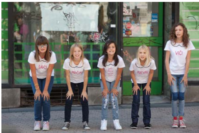
Željka Blakšić's WHISPER – TALK – SING – SCREAM (2012-13), still from video

Another collaborative work that provides a meeting point between voices and bodies is Željka Blakšić 44 WHISPER – TALK – SING – SCREAM . 45 Exploring the ways in which class and gender divisions in society can be articulated by means of music, the artist collaborated with local activists, independent journalists, and artists in order to compose protest songs disclosing the minority positions in society. She combined texts from various struggles in Croatia, including disenfranchised workers, young people who have lost their right to education, and persons who do not fit heterosexual normativity. In a performance using the form of child-play and children's song, girls aged ten to twelve perform in public space, not conforming to the traditional association of the feminine with the private sphere. The artistic procedure in which the weak—children, moreover girls—represent the weak subverts the usual positions, tackling the issues of the established yet often invisible mechanisms of dominant ideology. In this way, the artist promotes equality and encourages public participation of the younger generation in making decisions concerning public issues.