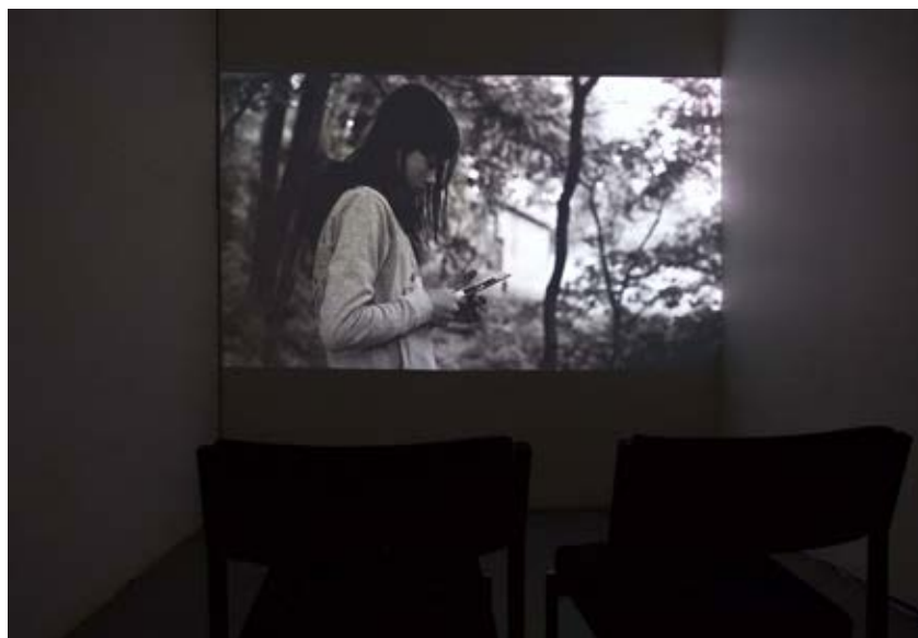
Zbyněk Baladrán, To Be Framed (2016), installation view in (Un)Commoning Voices and (Non)Communal Bodies , exhibition at Open Hand Open Space, Reading International, UK, 2019

without repeating and reproducing violence in a violent world. Is violence simply a part of the dialectic cycle of life and thus impossible to avoid?