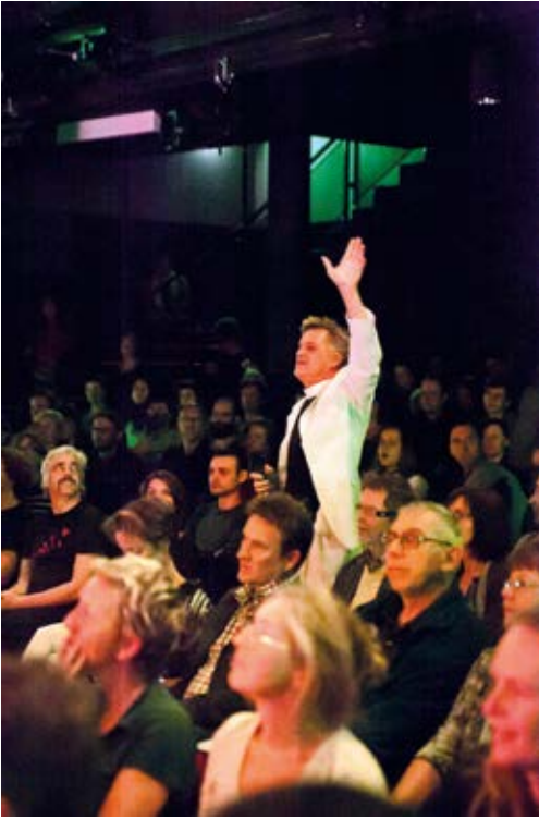
Reverend Billy at Truth is Concrete (Graz, 2012), © Thomas Raggam

F: Yes, because being in a safe space might change your personal situations—but not your social and political situation. You need to enter agonistic spheres in order to fight for your hegemonic project. And you need to create radical safe spaces—because mediocre safe spaces just produce superficial consensus.