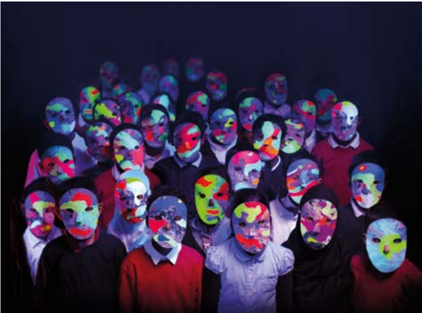
Mikhail Karikis, No Ordinary Protest (2018), production photo