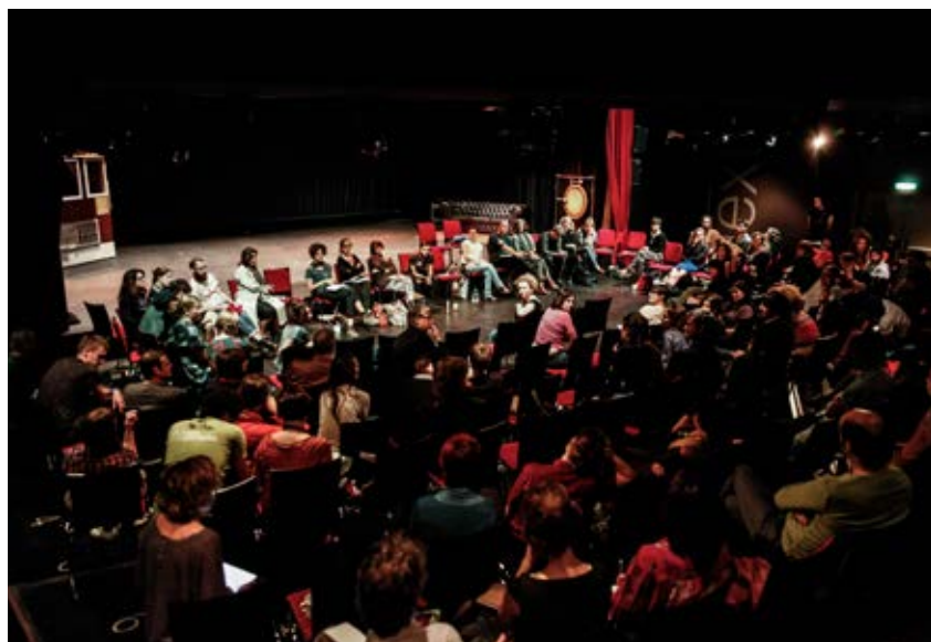
Final Assembly at Truth is Concrete (Graz, 2012)

M: In this project, do you see your role as a curator, as an artist, or as a dramaturg? And do you see an echoing between the kind of artists you are interested in and your curatorial or collaborative methodology?