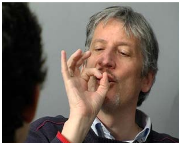
Katarina Zdjelar, The Perfect Sound (2009), still from video