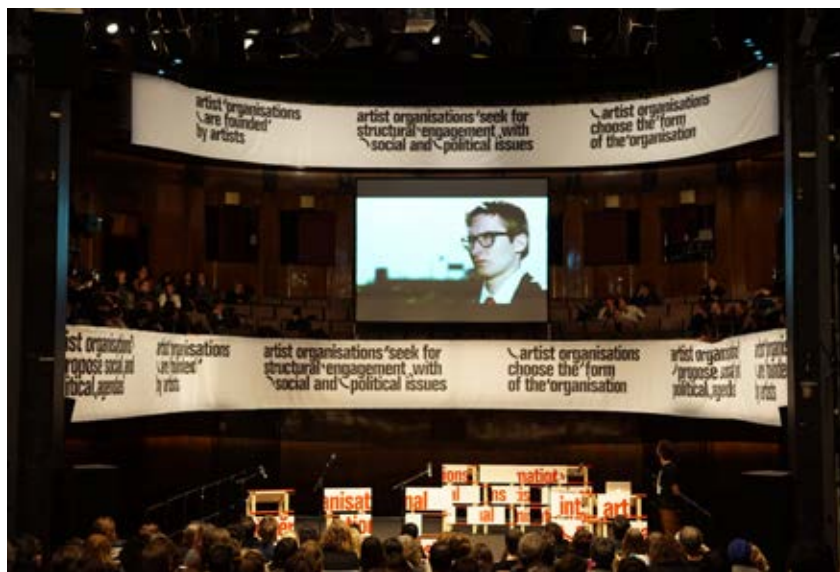
Artist Organisations International (Berlin, 2015)