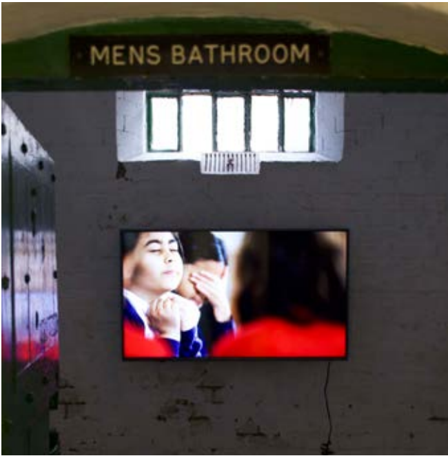
Mikhail Karikis, No Ordinary Protest (2018), installation view in (Un)Commoning Voices and (Non)Communal Bodies , exhibition at Open Hand Open Space, Reading International, UK, 2019