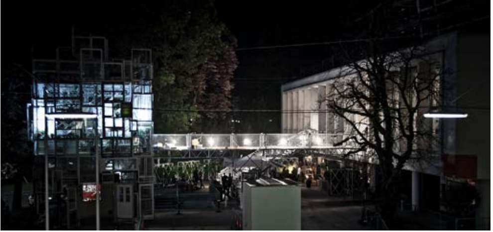
Truth is Concrete (Graz, 2012), © Thomas Raggam

the time together rather tight. One could say, the training is a proposal; it offers a beginning of something you might want to continue later on. But you also might disagree with some of the approaches: The trainings are quite diverse and sometimes might even be contradictory in their visions.