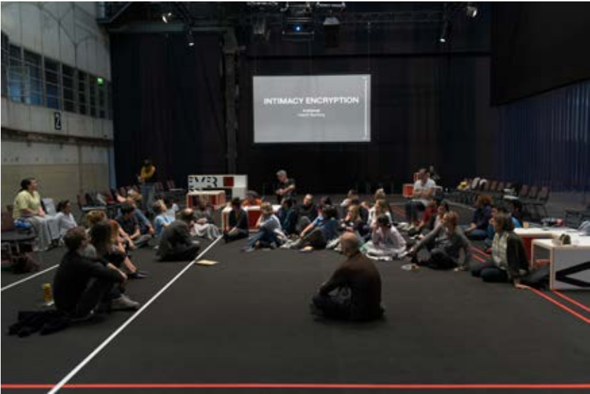
Training Intimacy Encryption by Irrational (Heath Bunting)