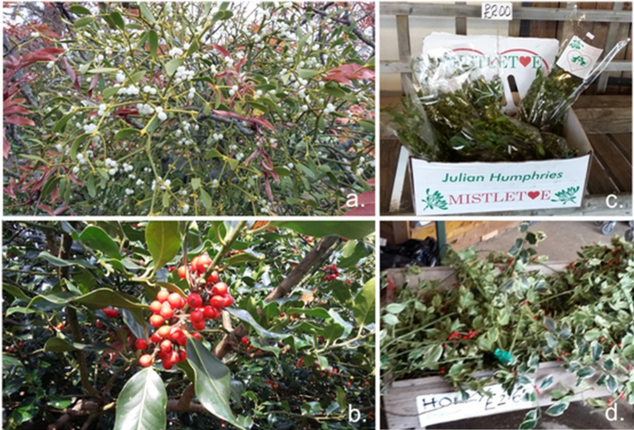
FIGURE 1: (A) Mistletoe and (B) holly berries growing on female plants in situ , and the same species packaged displayed for retail (C & D)

symbol of Christ's blood (berries) amidst his crown of thorns (the sharp leaves) while older Celtic lore describes holly wreaths as a ward against evil (Varner 2006). Mistletoe's usage is linked with pre-Christian winter solstice customs and with Norse mythology. Its use as an ancient symbol of fertility underwent a resurgence of interest in the 18th and 19th centuries and consolidated into the kissing tradition with which it is most commonly associated nowadays (Mabey 1996). As a result of these past associations, holly and mistletoe are commercially valuable non-food crops that are harvested and traded for their seasonal ornamental value. Although the traditions and folklore surrounding holly and mistletoe originate in Europe, their cultural value as ornamental plants has spread to many parts of the world, with other species of holly and mistletoe being used beyond the European range of I. aquifolium and V. album . For example, the mistletoe Phoradendron leucarpum shares a similar ecology to V. album and performs a comparable cultural and ornamental role in the USA.