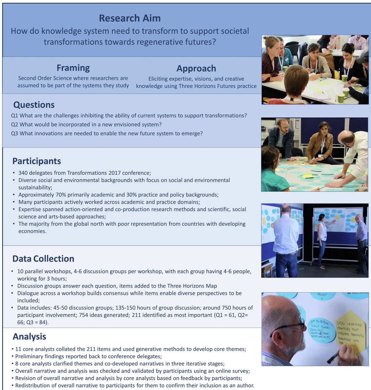
Box 1. The research methodology.

Multiple checks and balances were used throughout the process to ensure the results and narrative reflected the views and perspectives of researcher-participants and reduce biases created by interactions of research-participants acting in different roles, such as facilitators, analyst and participants in accordance with suggestions for enhancing rigor [36]. This included: (1) Sharing and deliberation of ideas in the parallel workshops at the conference; (2) careful coding and preliminary analysis using multiple analysts who had been present in different workshops; (3) feeding back preliminary analysis to participants during the conference; (4) multiple iterations of cross-checking by multiple analysts post conference; (5) working with comments from the researcher-participants about the overall narrative; and (6) final approval of the narrative through participants by agreeing to be a co-author before the paper was submitted. In this last stage, only one person declined to be an author, while four newly joined after email communication errors had been clarified. Combined with the facilitators and analysts, this led to the total of 183 authors on the paper. In conclusion, while a different group of participants may have led to