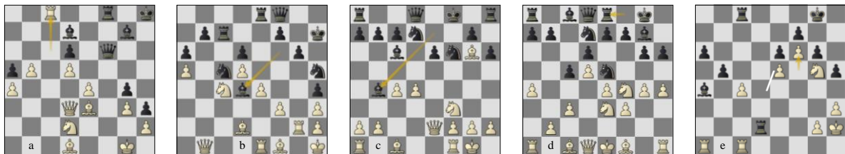
Fig. 3. 'Win on horizon' positions in the last five decisive games: Semi-finals, a) game 7 Ko-LC pos. 41b, (b) g8 Lc-Ko p32w, (c) g9 St-Sv p13w; (d) Bronze final g6 Sv-Ko p17w; (e) Final g2 St-LC p37b.

The play-off for the Bronze medal between STOOFLVEES and KOMODO involved adjacent seeds 4 and 5 with an Elo difference of only 2. Statistically then, it was the hardest match of the event to predict, especially as STOOFLVEES has treated us to both the most spectacular wins and the most horrendous blunders. However, here, the two contestants conjured five draws against the odds before STOOFLVEES finally broke through. Again, Figs. 2 and 3 show the game trend and a key position.