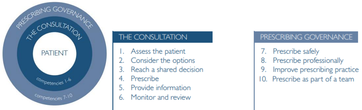
Figure 2 - Structure of A Competency Framework for All Prescribers