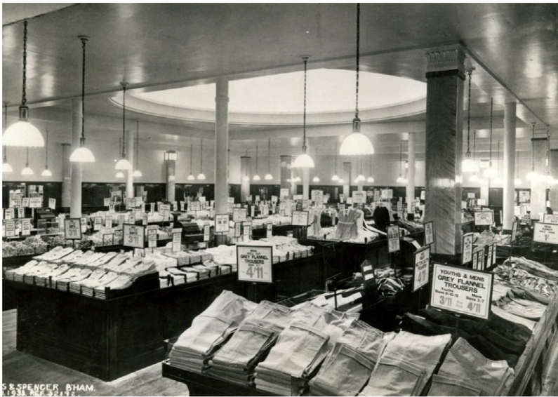
Figure 1. Open display at the M&S Birmingham store, January 1933.