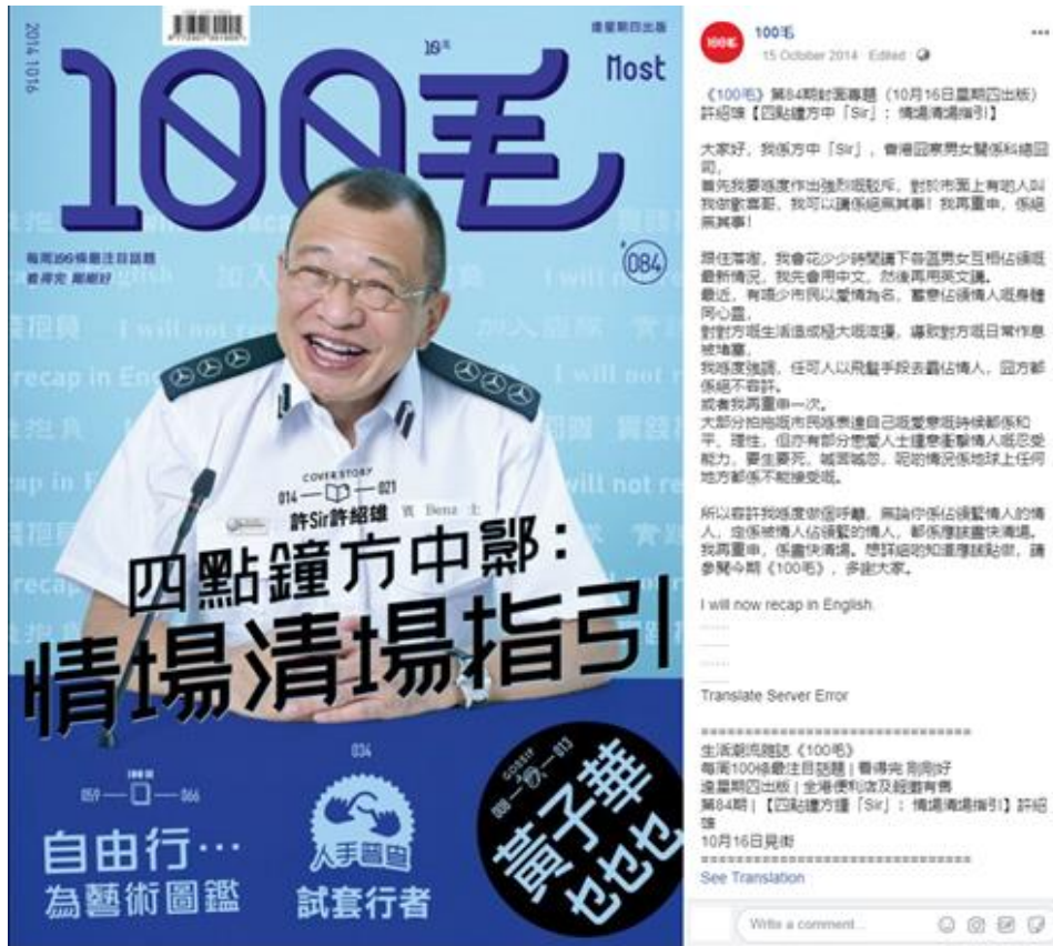
Figure 2: Cover of 100Most