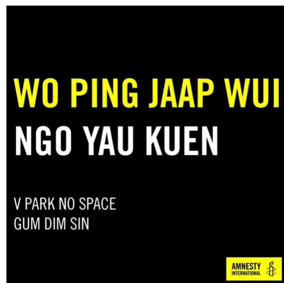
Figure 5: Poster by Amnesty International

Finally, as with the language mocking described in Section 3, this metalinguistic tactic, which began online, found its way onto the streets, with protesters at the August 18 rally and subsequent ones displaying signs in Romanized Cantonese such as that pictured in figure 6, which says “ HEUNG GONG YAN YIU JAANG HEI GA YAU ” (‘Hongkongers, hold our heads high, add oil’ 2 )