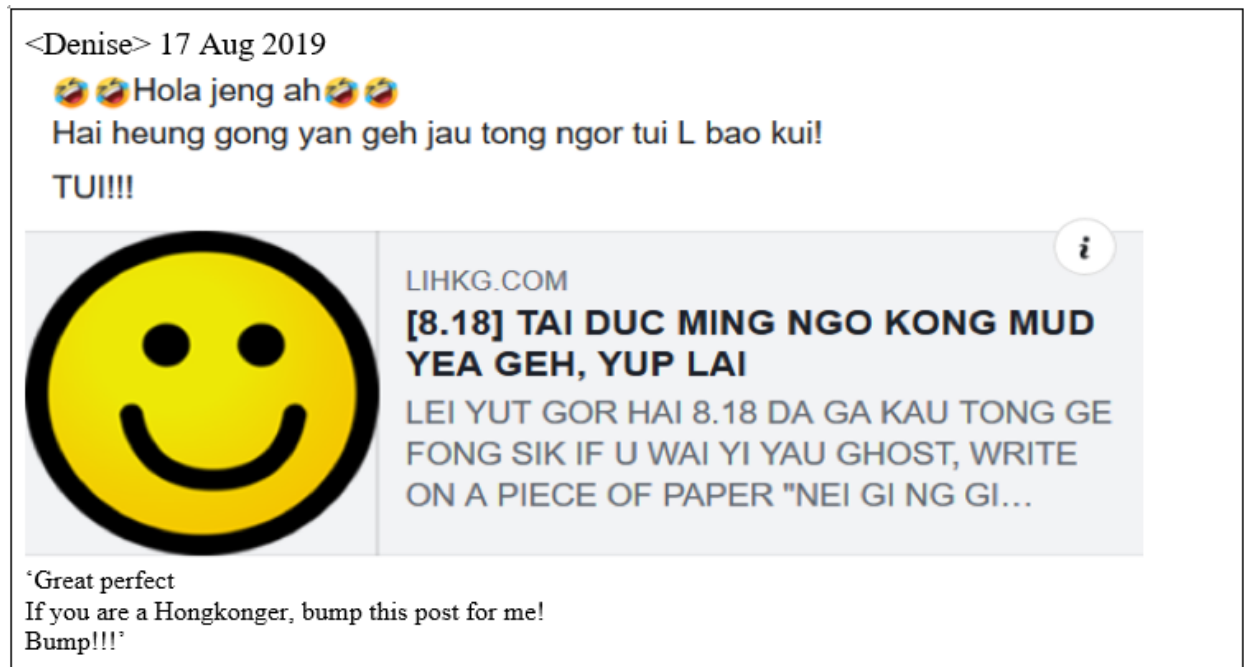
Example 11: Facebook, 17/08/2019

The rather obvious flaws of Romanized Cantonese as a “secret code” belie the fact that its primary purpose was not really to make messages indecipherable to “spies” but to build solidarity among users and strengthen their shared Hongkonger identity. In example 11, for instance, the poster shares the LIHKG thread on her Facebook page and invites specifically “ heung gong yan ” (‘Hongkongers’) to “bump” (‘share’) the post. In this case, the act of sharing is more metapragmatic than pragmatic (Blommaert 2015), less about actually promoting the practice and more about claiming a loyal “ heung gong yan ” identity.