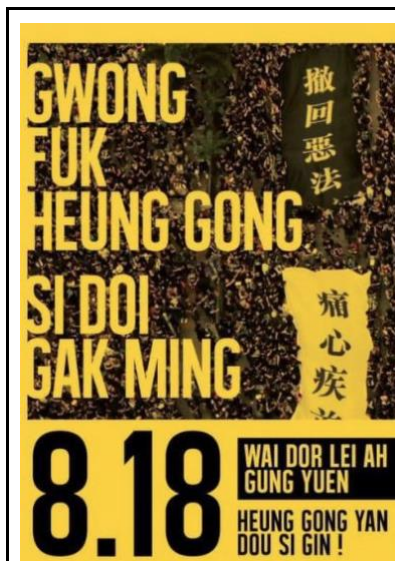
Figure 4: Cover of Apple Daily