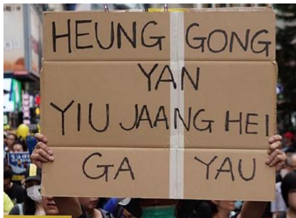
Figure 6: Sign in Romanized Cantonese

Finally, as with the language mocking described in Section 3, this metalinguistic tactic, which began online, found its way onto the streets, with protesters at the August 18 rally and subsequent ones displaying signs in Romanized Cantonese such as that pictured in figure 6, which says “ HEUNG GONG YAN YIU JAANG HEI GA YAU ” (‘Hongkongers, hold our heads high, add oil’ 2 )