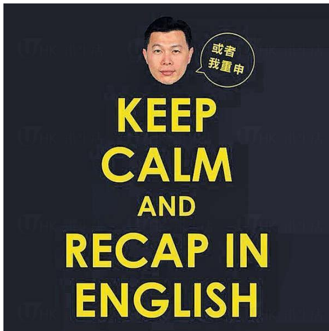
Figure 1: “Keep Calm” meme

#” (‘Maybe I’ll recap’) are inserted into the famous “Keep Calm” meme. Figure 2 is a Facebook post featuring the cover of 100毛 ( 100Most ), a satirical magazine, with a picture of a local actor Hui Shiu-hung dressed up like Hui Sir and the headline: “4pm with Fong Chung Sir: How to clear up your love relationships” (a pun invoking the “clearance” of protest sites). The extract from the article pasted next to it contains advice about romantic relationships written in the bureaucratic style of Hui Sir’s briefings, which ends with the words: “I will now recap in English”. But, instead of providing an English translation, the poster types a series of ellipses and the words: “Translate Server Error”, an expression used on social media in Hong Kong as a way of deriding others’ English ability. The catchphrase even found its way to the protest sites, as can be seen in figure 3, a pro-democracy ultimatum written in chalk on the street “voiced” through Hui Sir’s image and his catchphrase. In this case, it is unclear whether the non-standard features of the English version are a stylization of Hui Sir’s English or—equally plausible—features of the English spoken by the protester who wrote it (see below for further discussion of this point).