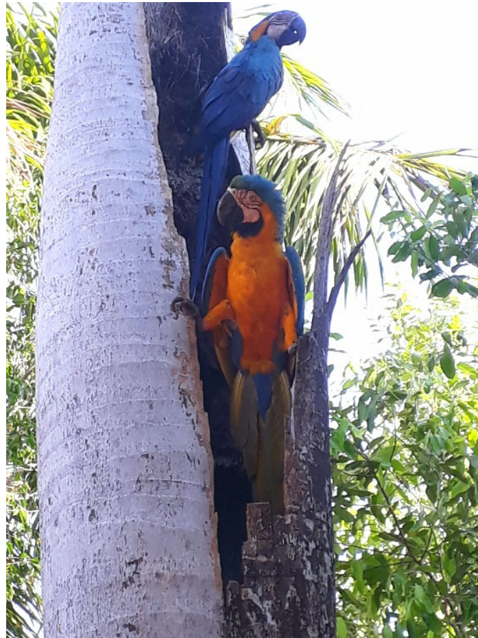
Figure 1. Blue-and-yellow macaws on a dead palm in a backyard in Rondonópolis.