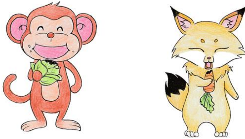
Figure 1 top. Example of the picture stimuli for the experiment

1 2 3 4 5 6 7 8 9 10 11 12 13 14 15 16 17 18 19 20 21 22 23 24 25 26 27 28 29 30 31 32 33 34 35 36 37 38 39 40 41 42 43 44 45 46 47 48 49 50 51 52 53 54 55 56 57 58 59 60 61 62 63 64 65