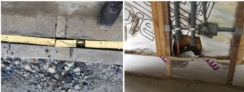
Figures 5 and 6 Ill-fitted insulation layers and rupture of vapour control layer

4.5.1 Quality results: On-site observations revealed that some defects had not been corrected. This was due to the fact that quality control tools (i.e. checklists and report templates) did not include those defects with potential to undermine the buildings' thermal performance. Figures 5 and 6 illustrate defects in housing units which had been considered satisfactory after being assessed for quality. These defects had not been spotted using the standard checklists. Apart from CS4, PQP did not provide a structured approach towards the prevention and correction of defects associated with the thermal performance of the dwellings.