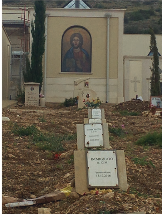
Fig. 4.3 Soil graves, labelled immigrato (immigrant), numbered, date of burial, Scicli, Sicily.