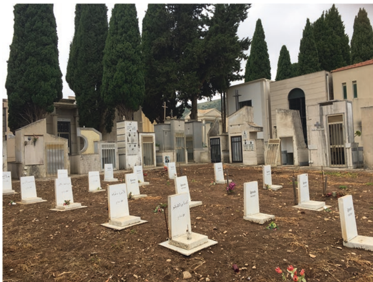
Fig. 4.5 Soil graves, partly labelled Ignoto (unknown), numbered, partly labelled with names in Arabic writing and age at death; Ragusa Ibla, Sicily.

residents in local municipal cemeteries, and are therefore spatially ‘in’. As a consequence of this, however, they cannot be easily identified, as they are absorbed in local cemeteries, and ultimately rendered invisible through this process of assimilation.