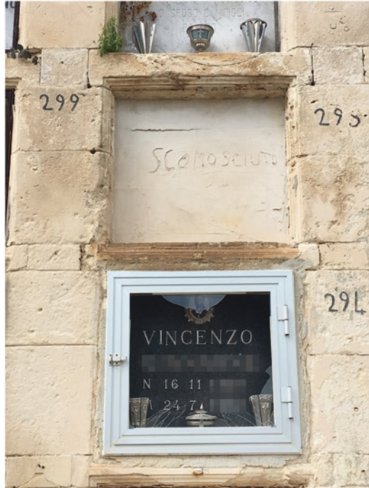
Fig. 4.4 Loculo (niche graves) labelled sconosciuto (unknown); Pozzallo, Sicily.

& O'Neill, 2012, p. 404), insofar as they contribute to additional “marginalization, abjection and disconnection” of the dead. This was the case for the cemetery of Sciacca (Sicily) where the remains of the migrants were removed from the loculi and were moved to a fossa commune (communal graveyard) – without informing known relatives who only discovered the removal during a subsequent visit. Although the relatives were traveling from other European countries and were unlikely to be familiar with the local cemetery system in Sciacca, they were ultimately held responsible for the unwanted transfer of what the local cemetery warden perceived as corpses “who did not have an identity, who did not have a first or last name. [...] The relatives did not communicate the name to us, so we did not know. Otherwise, we would not have done it, or rather: we would have asked for consent.” (Damiano, cemetery warden, Sciacca, Sicily).