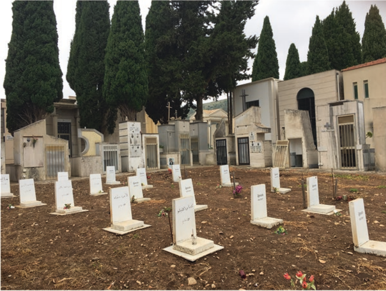
Fig. 4.5 Soil graves, partly labelled Ignoto (unknown), numbered, partly labelled with names in Arabic writing and age at death; Ragusa Ibla, Sicily.

residents in local municipal cemeteries, and are therefore spatially ‘in’. As a consequence of this, however, they cannot be easily identified, as they are absorbed in local cemeteries, and ultimately rendered invisible through this process of assimilation.