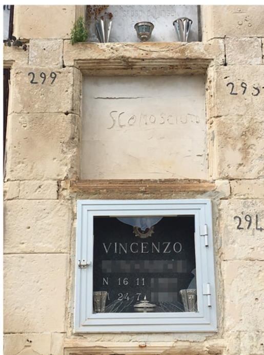
Fig. 4.4 Loculo (niche graves) labelled sconosciuto (unknown); Pozzallo, Sicily.

& O'Neill, 2012, p. 404), insofar as they contribute to additional “marginalization, abjection and disconnection” of the dead. This was the case for the cemetery of Sciacca (Sicily) where the remains of the migrants were removed from the loculi and were moved to a fossa comune (communal graveyard) – without informing known relatives who only discovered the removal during a subsequent visit. Although the relatives were traveling from other European countries and were unlikely to be familiar with the local cemetery system in Sciacca, they were ultimately held responsible for the unwanted transfer of what the local cemetery warden perceived as corpses “who did not have an identity, who did not have a first or last name. [...] The relatives did not communicate the name to us, so we did not know. Otherwise, we would not have done it, or rather: we would have asked for consent.” (Damiano, cemetery warden, Sciacca, Sicily).