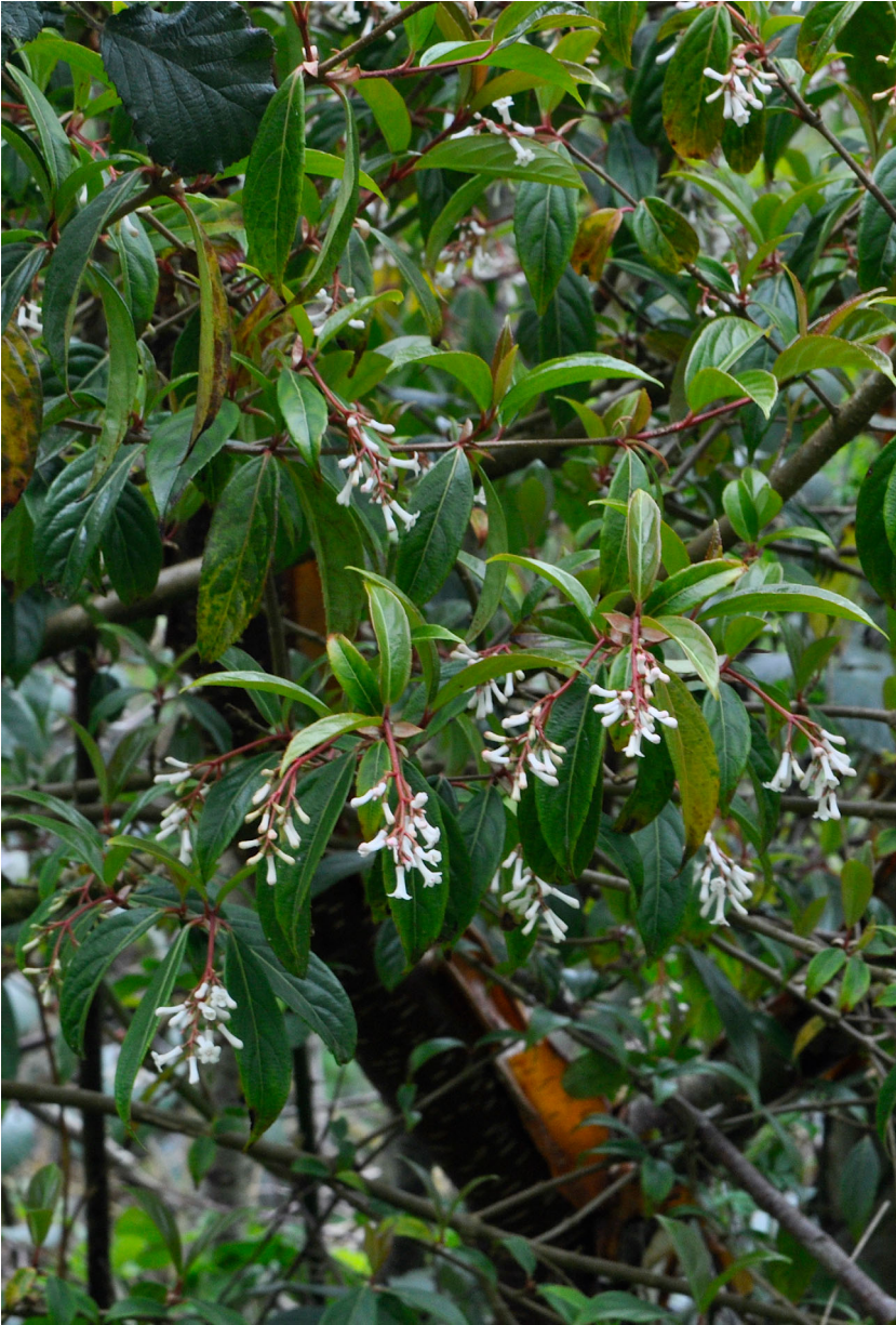
FIGURE 1 Viburnum oliganthum , flowering in North Devon.