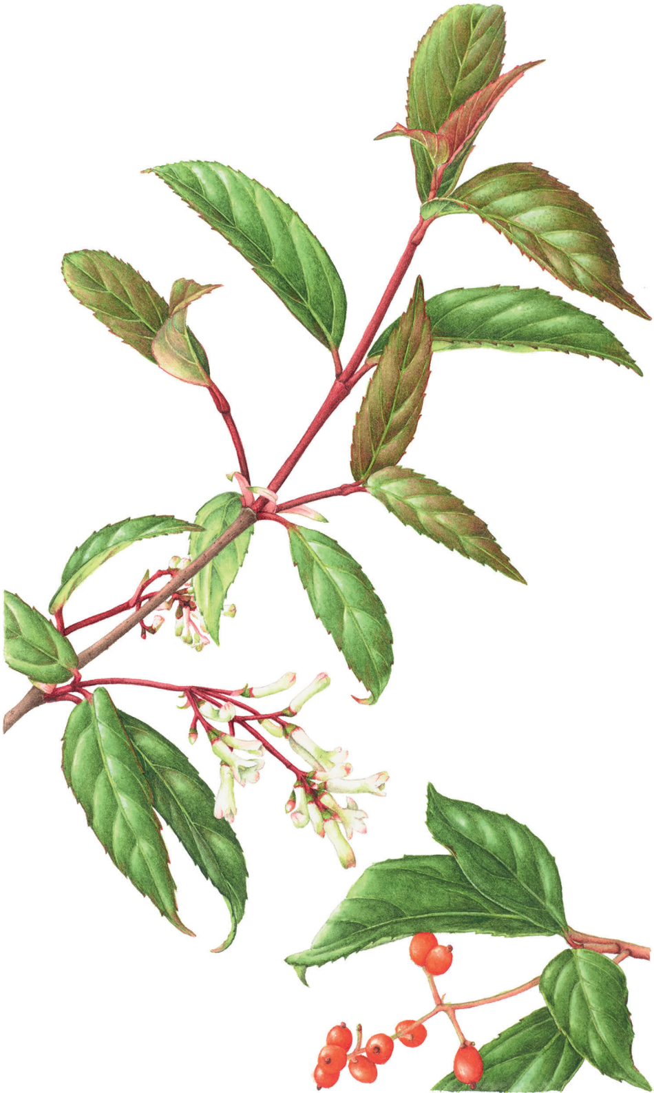
PLATE 1066 Viburnum oliganthum