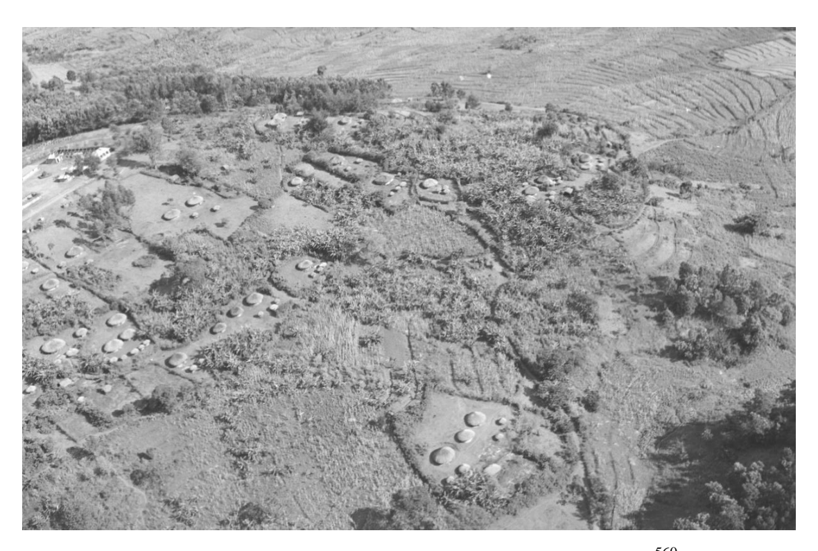
Figure 10: Aerial view of Gĩkũyũ homesteads in the Kikuyu Reserve. 560

proposed in the camps knowingly undermined Gĩkũyũ household structures. The British approach to defeating the Mau Mau was more about undermining those associated to the enemy, than promoting the freedoms of collaborators. While Chapter I explores the decision making behind the proposed layouts of the camps, this section examines how this impacted the social units of those forcibly resettled. Spatial undermining impeded gender and generational relations which ultimately demonstrates how the colonial government sought to negotiate control of those forcibly resettled through camp spatiality. The design of a Gĩkũyũ homestead, known in Gĩkũyũ as mũciĩ , prior to villagisation is an important point of comparison when analysing how individuals were forced to rebuild in their new settlement sites. Charles Trotter, a professional photographer in Nairobi during the 1950s, captured an aerial view of some Gĩkũyũ homesteads in the Kikuyu Reserve as they were in 1952 (figure 10). As the photograph displays, each homestead has several separate buildings. Each separate homestead is marked out by boundaries, done so through the placement of trees, hedges and bushes.