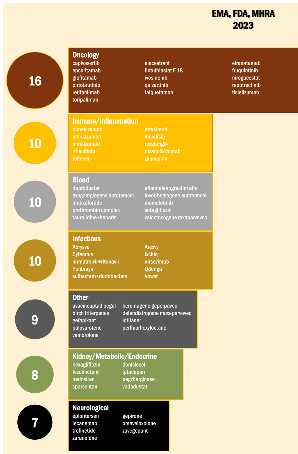
FIGURE 2 New drugs approved in 2023 by the European Medicines Agency (EMA), Food and Drug Administration (FDA) and Medicines and Healthcare Products Regulatory Agency (MHRA), by therapeutic area/category.

reduced the risk of developing RSV-associated LRTD by 82.6% in people 60 years old and older, regardless of RSV subtype or the presence of underlying coexisting conditions. For both vaccines, safety and serious adverse effect profiles were not statistically different than those of placebo.