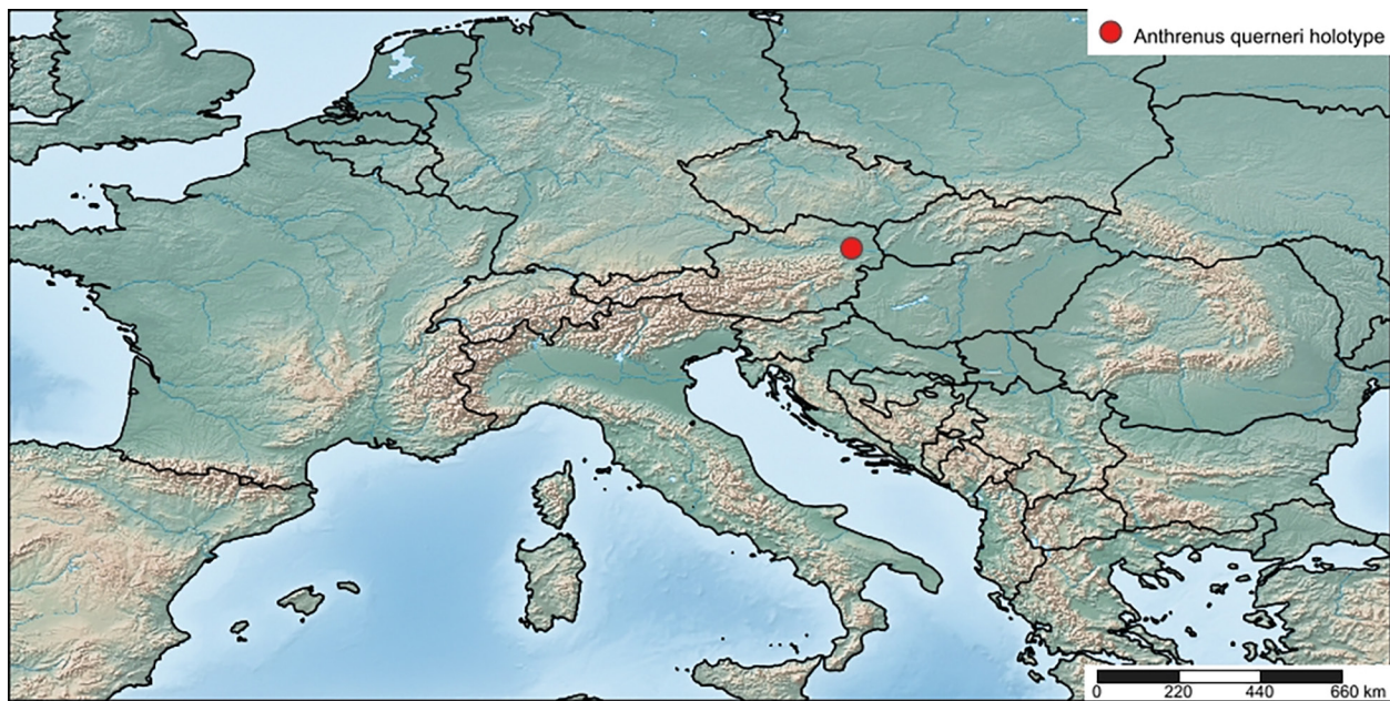
Figure 3. Location of collection of Anthrenus quernerii holotype.

extend down the lateral margins becoming progressively shorter to the mid-point where the margins narrow to form a neck. From the neck, the margins diverge and continue as smooth curves to the anterior, ending in two narrow, curved horns.