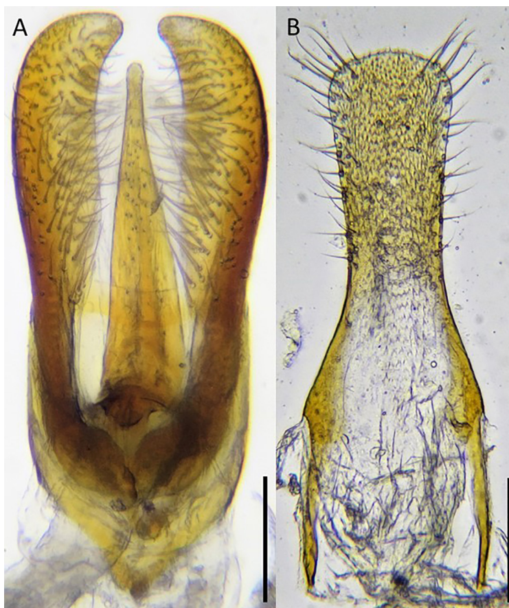
Figure 5. Anthrenus pimpinellae . A) Aedeagus dorsal aspect. B) Sternite IX. Scale bar = 100 \mu m in both cases.

The number of known species within the Palearctic A. pimpinellae complex continues to increase. Holloway and Herrmann (2024) list 25 species, this study increases the number to 26. This is the third A. pimpinellae lookalike species described from Europe, the others being A. amandae Holloway, 2019 from Mallorca and A. chikatunovi Holloway, 2020 from the Pyrenees. As well as similar color patterns, all also have quadrate antennal clubs. Insect