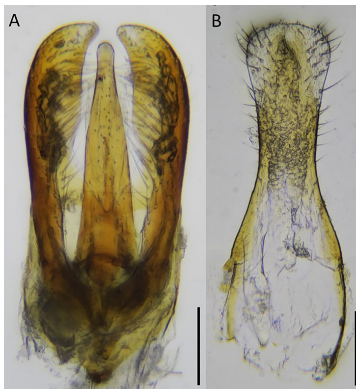
Figure 2. Anthrenus quernerii . A) Aedeagus dorsal aspect. B) Sternite IX. Scale bar = 100 \mu\text{m} in both cases.

Sternite IX (Fig. 2B, SL = 473 \mu\text{m} ) with broad posterior lobe. The apex is clear laterally, the rest of the sternite is pale brown. The medial apex of the posterior lobe is a smooth, shallow curve. The clear lateral components of the apex are covered in setae, longest towards the lateral corners and absent along the apical margin. The setae