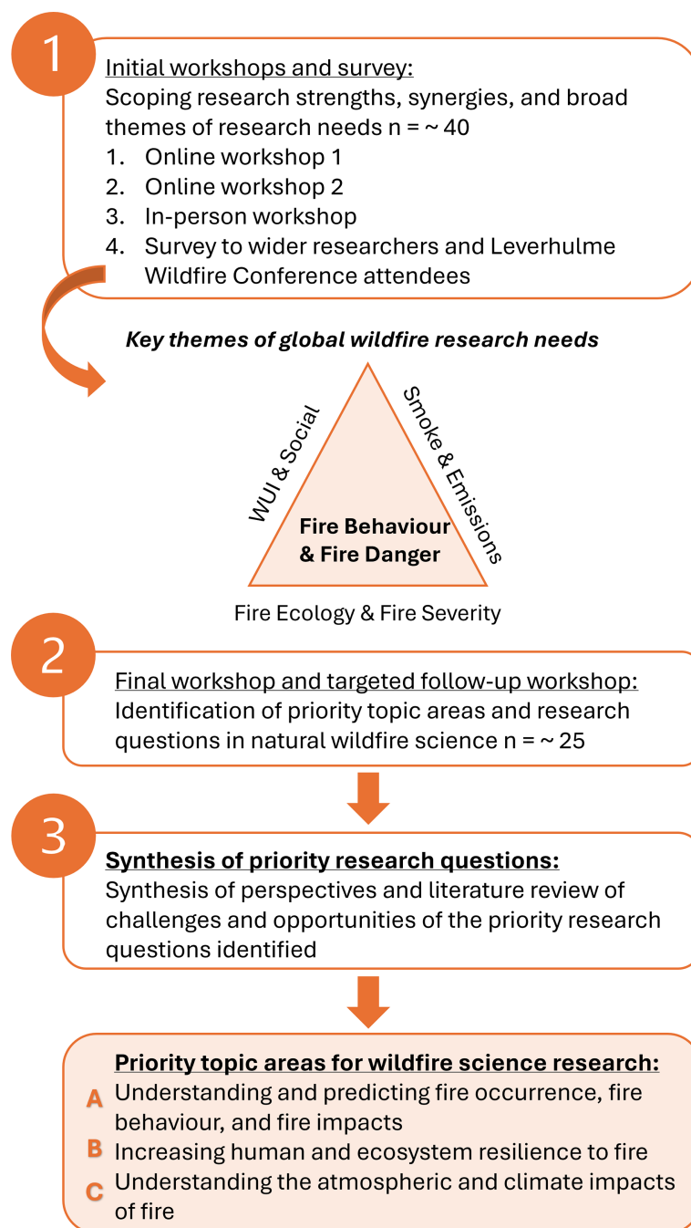
Figure 1. Methods employed to identify the priority research questions.

Participants highlighted how, in many cases, research gaps exist between wildfire research on different scales. For example, models that are deemed sufficient on global scales were perceived by participants to be relatively poor at simulating on a regional scale, particularly in terms of fire behaviour and smoke dispersion. A common theme from workshop discussions was thus the need for a more universal view of fire as a global process, tying wildfire research on different spatial scales and across different disciplines together.