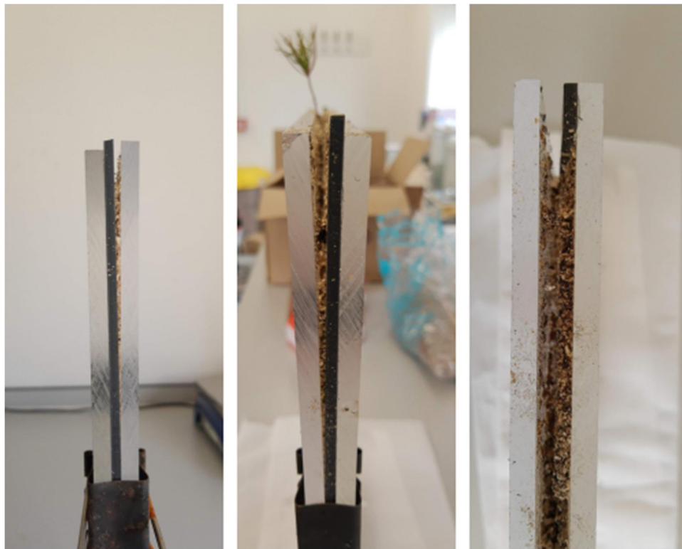
Figure 6. Gaps opened in the microcosms due to the folding back of the Perspex plates. In some cases, the gaps between the plates were as wide as 0.5 cm.