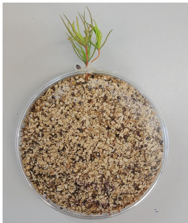
Figure 1. Example of the inoculation set-up. Three P. sylvestris seedlings were positioned with the roots inside a petri dish filled with peat and vermiculite, inoculated with agar plugs with S. granulatus , and sealed with Parafilm® and anhydrous lanolin.

After 20 days, the seedlings were inoculated with Suillus granulatus obtained from the University of Reading mycological collection. In a laminar flow cabinet, Petri dishes were prepared by carving a notch in one of the edges with a hot scalpel. They were filled with peat and vermiculite (1:4, v:v) that had been previously sieved through a 2 mm mesh and disinfested by autoclaving at 105^{\circ}\text{C} for 1 h on two consecutive days. Three seedlings were laid on the peat with the stems protruding outside through the notch (Figure 1). Two or