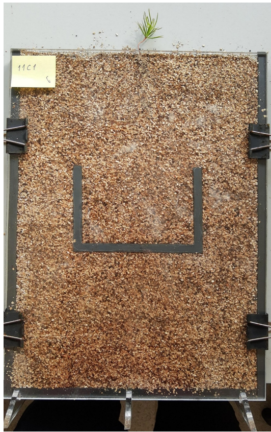
Figure 2. Photograph of one of the microcosms prior to being wrapped in aluminium foil and before the interventions to secure it.

the maze and all the measures can be found in Supplementary Material 2. Then, the microcosms were filled with the sterile mix of peat and vermiculite, moistened by spraying MMN medium. One seedling was placed on the top of the microcosm. Subsequently, silicone sealant was applied along the maze, and the microcosm was covered with the other Perspex plate. Four 0.41 cm-wide fold-back clips were used to hold the plates together. The control and inoculated microcosms were set up alternately by two people to avoid bias between how the experimental groups were set up. Some seedlings had already evident and well-formed mycorrhizal tips before being transferred to the microcosms (Figure 3a,b).