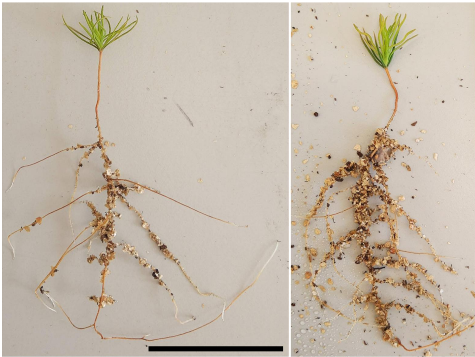
Figure 5. Seedlings of P. sylvestris 4 weeks after inoculation with S. granulatus in Petri dishes with peat and vermiculite, before being used in the microcosms. On the left, a control seedling. On the right, an inoculated seedling. Note the unusually extensive development of the root system. The scale bars represent 5 cm for both seedlings.