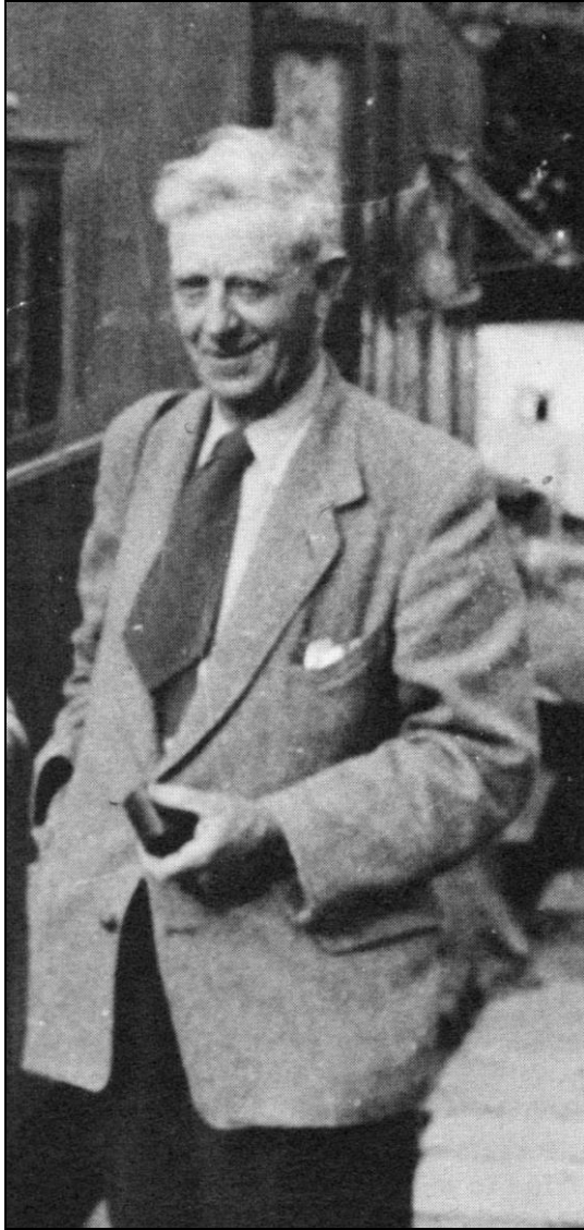
Figure 1: C.E. (Charles Edward) Bean, 1892–1983 (PDNHAS 1983: 182)