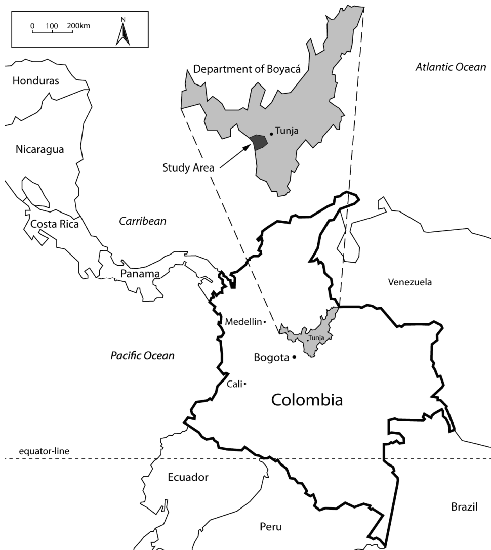
Figure 2- Study area (after Oehler 39 ).

The predominant pesticides used for potato production are carbofuran (insecticide), mancozeb (fungicide), and methamidophos (insecticide). Pesticide misuse has been observed, among other issues, with respect to safety practices. 8,32,38