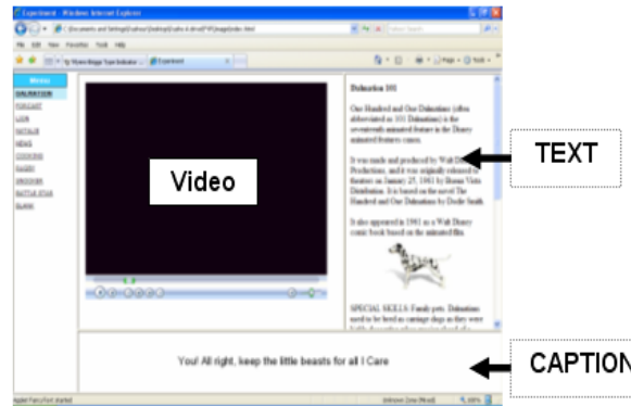
Figure 1: Multimedia Interface

3.2.1. Measuring User Information Assimilation (QoP-IA). QoP-IA is expressed as a percentage measure that reflects the percentage of correct answers that a user gave to questions. All questions had an unambiguous answer, making it possible to determine whether a participant answered them correctly or not. Moreover, for each question, the source of the answer was easily determined, as it was only present in one specific information field: V, C, VS, T. Caption (C) data was edited to ensure minor variation in wording between C and VS data sources. Accordingly, questions answered specifically could be related to specific information sources. It is therefore possible to determine from which information sources participants assimilated information. This makes it possible to determine and compare differences that exist in a users' information assimilation.