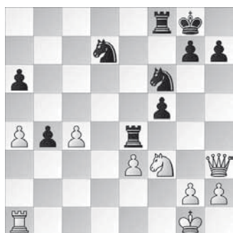
a) 5.2 HIARCS–JUNIOR, 25b

Standings: 1 HIARCS 7, 2= JUNIOR and PANDIX 6½, 4 JONNY 5½, 5 SHREDDER 4½ and 6 MERLIN 0