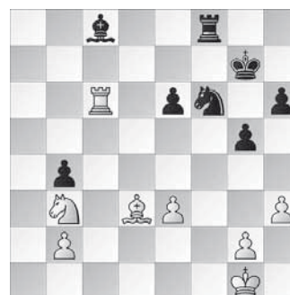
c) 10.3 JUNIOR–HIARCS, 35b