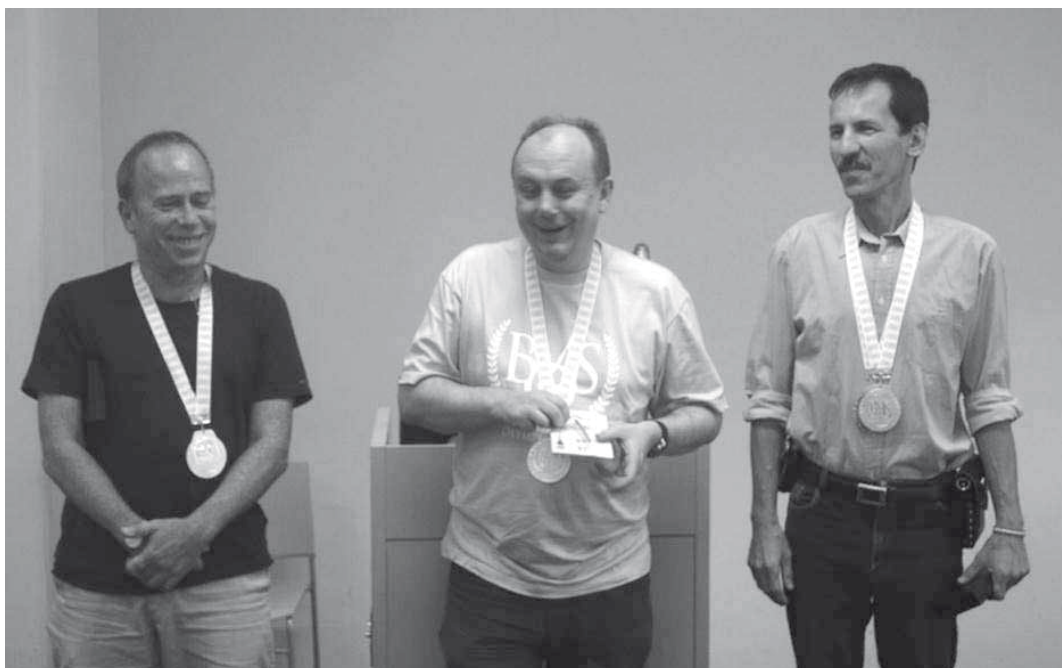
The WCSC 2013 Podium