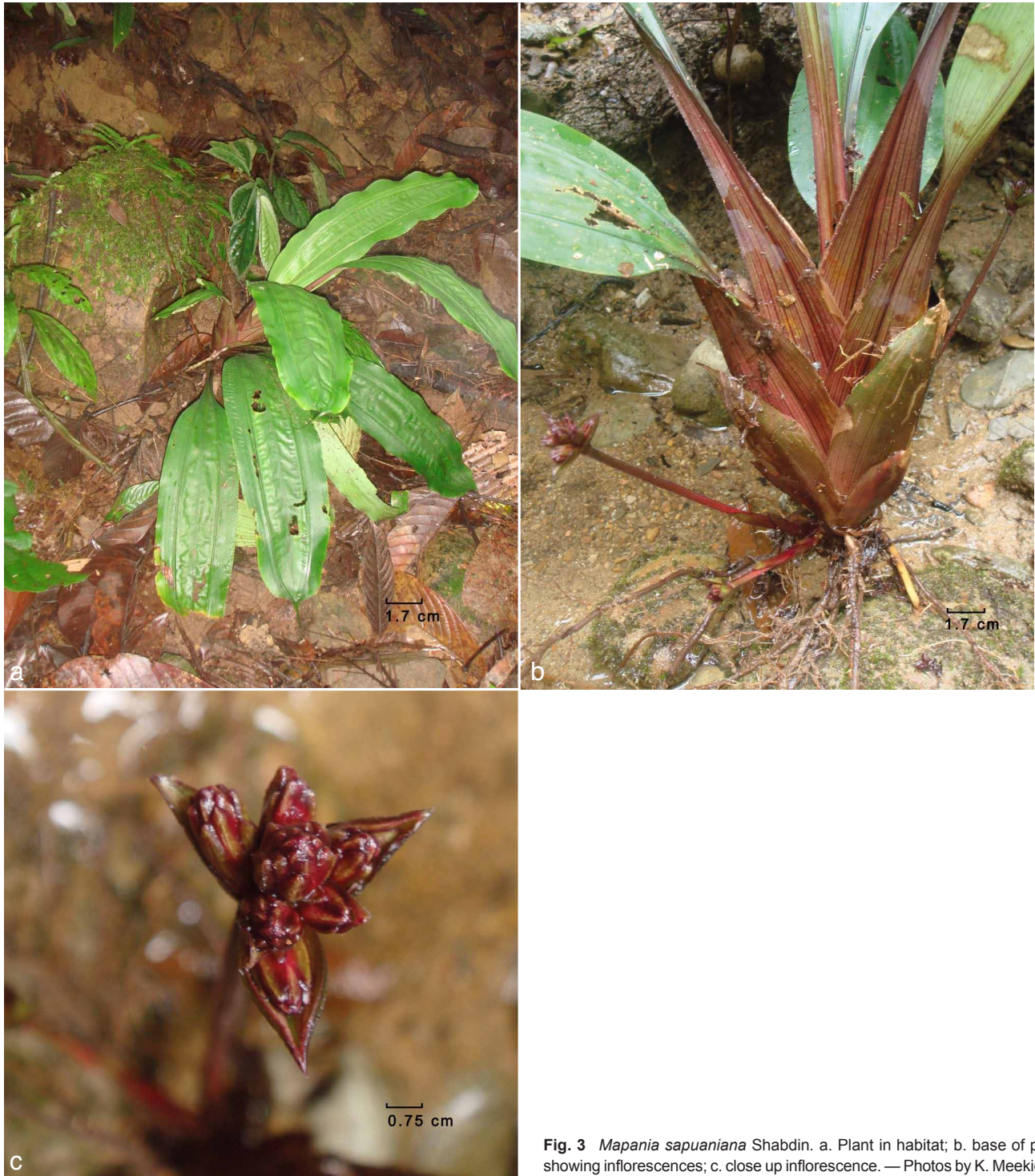
Fig. 3 Mapania sapuaniana Shabdin. a. Plant in habitat; b. base of plant showing inflorescences; c. close up inflorescence.

therefore describe this species based on the morphological / taxonomic species concept (Cronquist 1978).