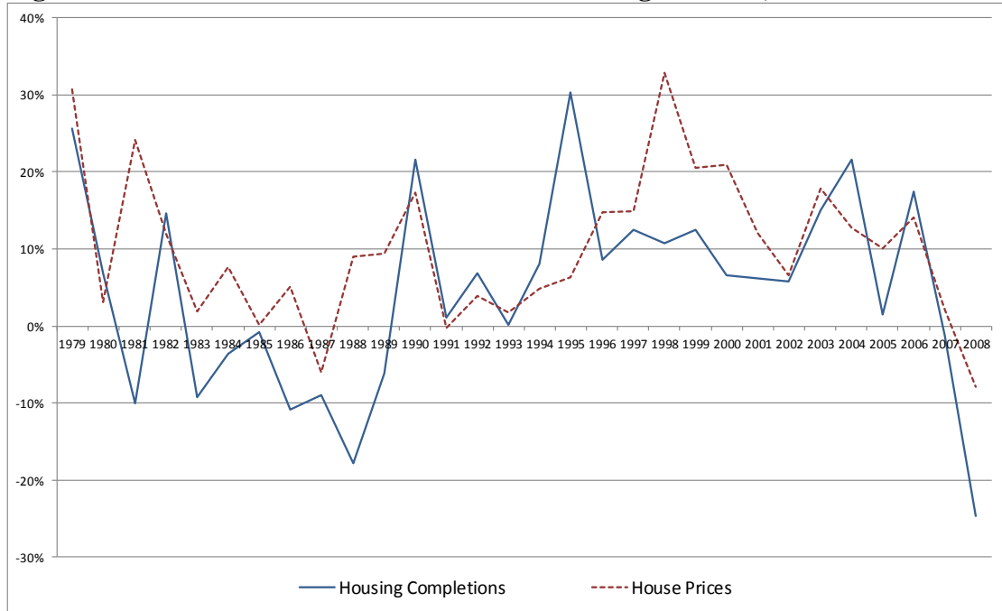
Figure 2: Annual Growth Rates in the Irish Housing Markets, 1978-2008

Notes: Figure 2 reports the annual percentage changes in the annual number of private sector completions in the Irish residential sector and average nominal house price.