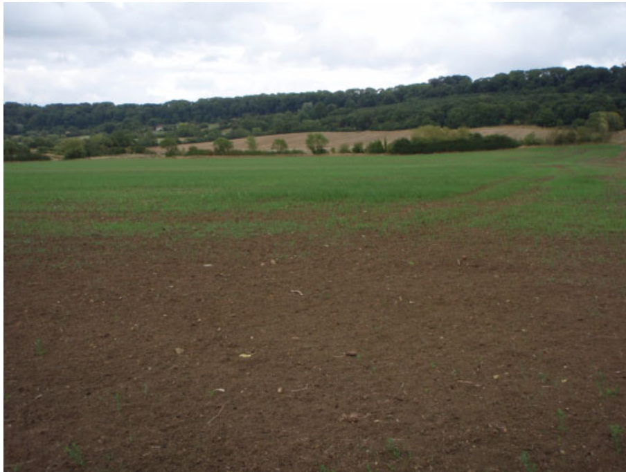
Figure 3. Cereal crop production, Warwickshire, UK. Soils are often seen as simply 'growing media' for food crops; however, functioning of microbiological communities within soils not only influences the supply of essential plant nutrients but also has great implications for the global carbon cycle and climate system that determines whether environmental conditions are favourable for crop growth.

the C cycle does not operate independently; it is closely coupled with that of other essential elements for microbial metabolism. This linkage occurs either via the use of the other elements as electron donors and acceptors (e.g. N species ranging from the most reduced, \text{NH}_4^+ , to the most oxidised, \text{NO}_3^- ) in energy transduction or via their immobilisation and mineralisation as part of multiple essential element-containing biomolecules (e.g. proteins, DNA). Hence the availability of other key elements essential for life, particularly N and P, and other environmental factors such as pH, soil texture and mineralogy, temperature and soil water content control the rate at which microbes consume and respire carbon. 11 It is these interactions between environmental conditions and biological processes, including primary production, that are chief in controlling the unequal distribution of organic matter across the world's soils. 12 The largest global concentration of carbon can be found in wet and cool areas in the northern hemisphere, dominated by deep accumulations of peat and permafrost soils, 13 whereas soils with the lowest carbon content tend to be those of desert biomes, 14 where low mean annual precipitation limits primary production and encourages the prevalence of aerobic soil conditions.