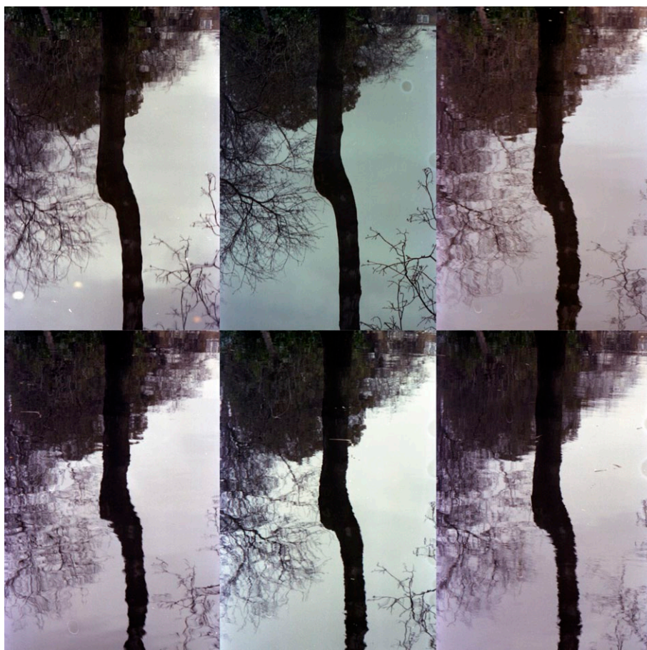
Images from the book Ruskin's Pond - John Woodman 2010, UniPress Cumbria © John Woodman. www.johnwoodman.net