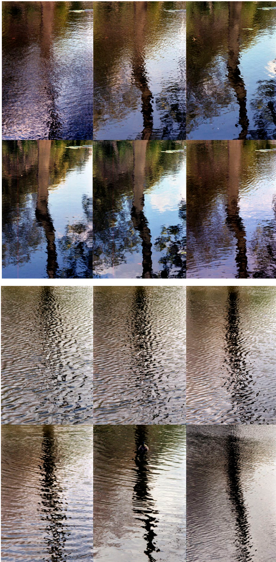
Images from the book Ruskin's Pond - John Woodman 2010, UniPress Cumbria © John Woodman. www.johnwoodman.net