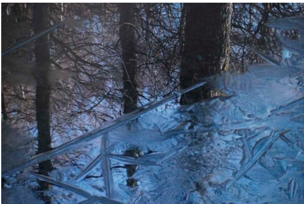
January 2011 (1) Brantwood . Still from the series of videos 'Ruskin's Ponds' - John Woodman, 2012.