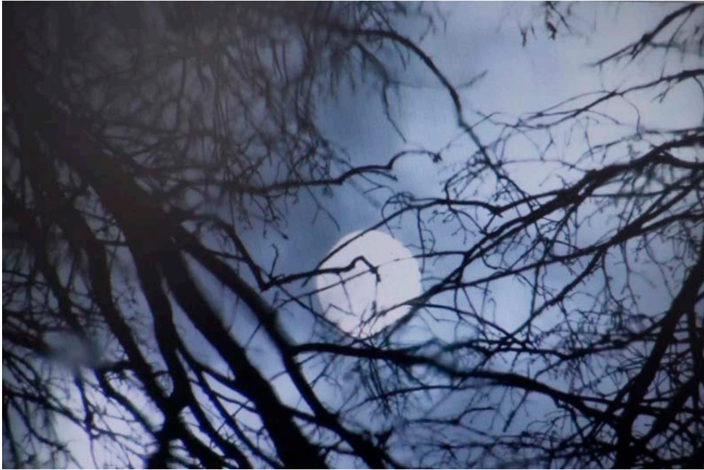
March 2011 Brantwood . Still from the series of videos 'Ruskin's Ponds' - John Woodman, 2012. © John Woodman. www.johnwoodman.net