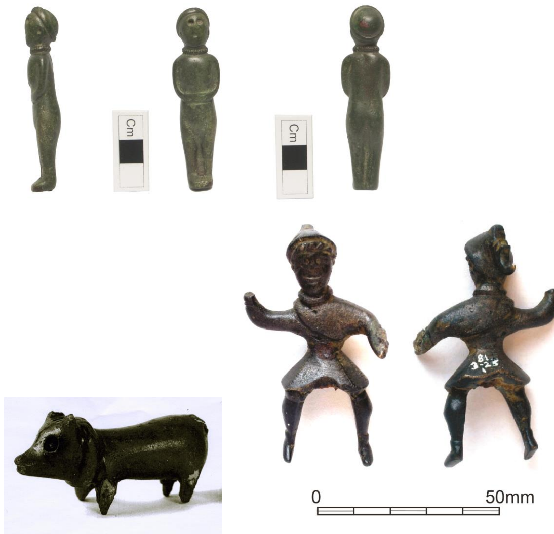
Fig. 9. (a) Mother Goddess from Henley Wood Temple; (b) Boar from Motcombe; (c) Rider from Ashdown (Oxon.).

cast silver or gold torc, 41 only one other figurine, a rider from Ashdown (Oxon.), has an integrated torc around the neck (FIG. 9c). 42 There are also stone images of figures wearing torcs in Britain, such as that from Wellow (Somerset) which depicts a woman dressed in a long pleated tunic, much like that seen on the Southbroom Mother Goddess. 43 The Ashdown rider is another stylised figurine which exhibits a similar style to that of the Southbroom figurines. In addition to the torc, he has close-set socketed eyes and a rather flat, almost featureless face in which the slit mouth is just visible; similar to the features also seen on the Henley Wood Mother Goddess. Like the helmet-wearing Southbroom figurines, the rider has a moulded helmet, with a brim forming a ridge around the head, but unlike the Southbroom figurines, he does have hair showing on his forehead. The helmet also has a crest, which is in the form of a narrow ridge along the back of the head, much like those seen on the Dragonby Mars and the raven-topped helmet of Mars M4. The clothing is very simply depicted, and does not have any deep folds or pleats, but the cloak is shown by a deep moulding, an effect