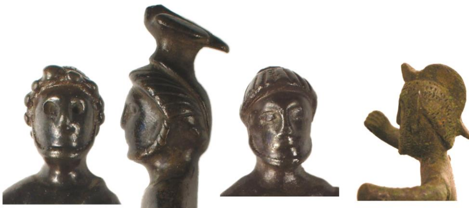
Fig. 6. The beards on: (a) Vulcan M13; (b) Mars M4; (c) Neptune (a–c Reproduced by kind permission of the Trustees of the British Museum ) and (d) the Dragonby Mars. ( Reproduced by kind permission of North Lincolnshire Museum Service )