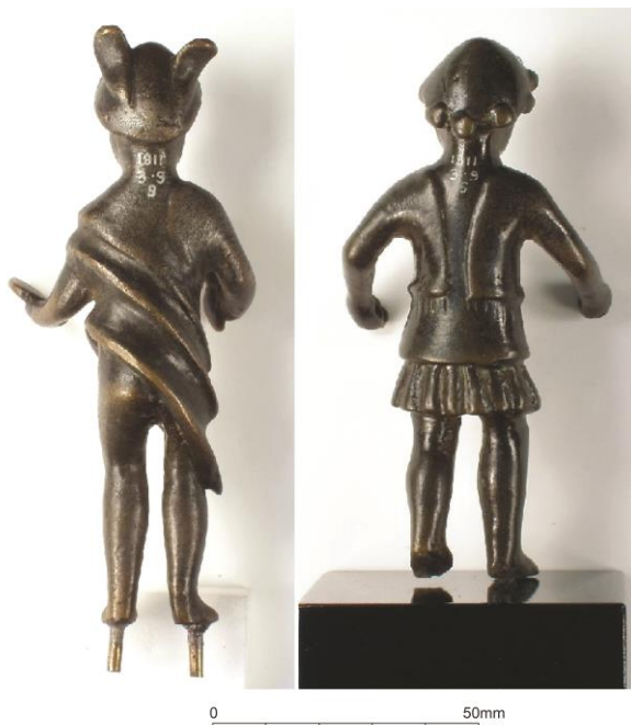
Fig. 7. The rear of (a) Mercury and (b) Sucellus.

short vertical incisions along the upper edge (FIG. 7b). Many other depictions of Sucellus show him wearing a simple jacket which is closed at the front by a belt, sometimes with a thick fold of fabric over the belt. 28 Boon suggested that the jacket might represent a protective leather garment worn by an artisan, an item which would be appropriate for the hammer god. 29 Vulcan M13 wears the attire seen on many other figures of this type: a pleated skirt, topped with a tunic which is fastened on his left shoulder, leaving the right shoulder uncovered. The unidentified figurine also wears a simple tunic on his upper body, but his lower body is missing so it is not possible to say whether he wore a pleated skirt. Minerva appears to be wearing a plain tunic which extends to near her knees (FIG. 4g). The lower part of the figurine is missing, but there is no indication of a pleated skirt. She also wears what appears to be a short cloak across her shoulders, which narrows to its lowest point in the mid-chest and back. Perhaps this was meant to represent the aegis often worn by Minerva.