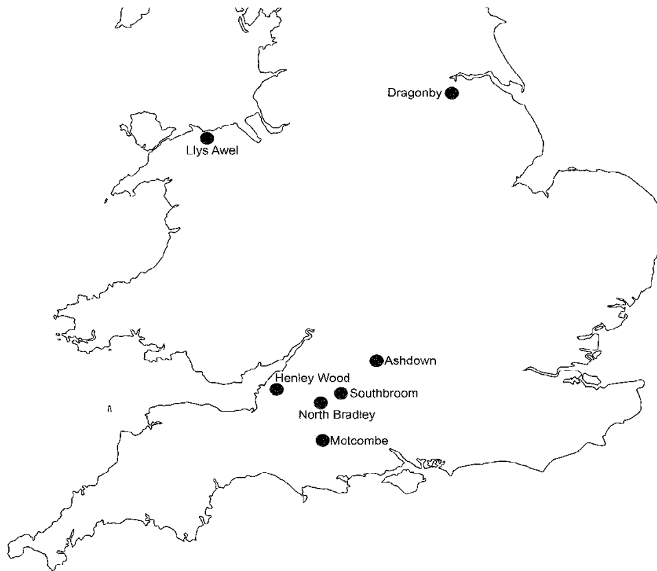
Fig. 1. Location of sites mentioned in the text

A close examination of both the stylistic and symbolic features of these figurines provides interesting insights into artistic and religious influences in early Roman Britain.