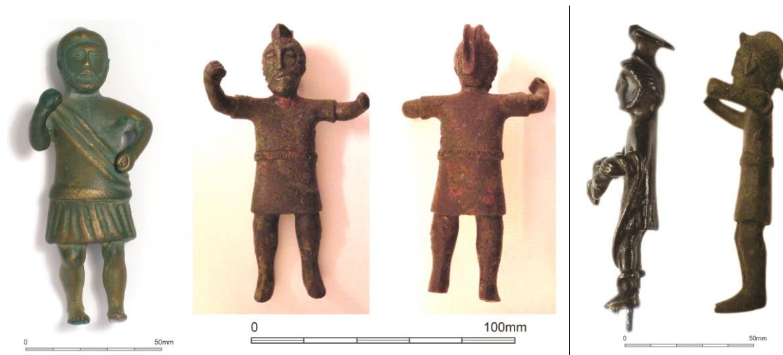
Fig. 8. (a) Vulcan from North Bradley (Wilts.); (b) Mars from Dragonby (North Lincs.); (c) Profiles of Mars figurines from Southbroom (M4) and Dragonby.

Southbroom figurines has a rather thin and flat profile (see FIG. 8c). The stylised depiction of his helmet is not unlike that seen on the Minerva or Mars M4 from Southbroom and like Mars M4 there is a narrow strip down the centre of the head. The Dragonby helmet has a narrow pointed ridge at the front and back and a deep groove along its length indicates the crest. Henig also highlights the belt worn by this figurine, but the belt on the North Bradley Vulcan is less obvious. In fact, all of the Southbroom figurines have a well-defined fold in the fabric between the tunic and skirt, and on two figures (Sucellus and Mars M2) the fold does appear rather like a belt.