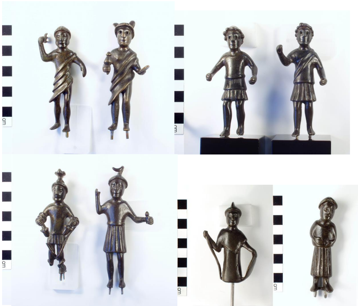
Fig. 4. Figurines from Southbroom: (a) Neptune; (b) Mercury; (c) Sucellus; (d) Vulcan M13; (e) Mars M4; (f) Mars M2; (g) Minerva; (h) Mother Goddess M7.

similar and both stand with the left hand palm up to hold the pot with which Sucellus is often depicted, while the Augst figurine also holds a fragment of an iron hammer in his right hand (FIG. 5). 13 Unfortunately the attributes are missing from the clenched hands of the Southbroom Sucellus. Although Boon identified figurine M3 as Jupiter (FIG. 4a), it is interesting to note that Cunington preferred Neptune. 14 The figure is certainly holding a trident and although Neptune is not a particularly common subject for small bronzes, and this would be the only such figurine from Britain, he does appear in small numbers on the Continent. 15 Two figurines, M2 and M4 (FIG. 4e and f), are particularly difficult to identify. Figurine M4 is called ‘uncertain Celtic’ by Boon, but he notes that Anne Ross identified it as Mars and this attribution was also accepted by Aldhouse-Green. 16 The two attributes which led to the identification of this figure as Mars – the raven-topped helmet and the ram-horned snake which he holds in each hand – are more fully discussed below. It has also been suggested that figurine M2 could be Mars, although this identification is less certain. 17 The stance and the helmet are typical of many Mars figurines, including the missing classical Mars M10 from the hoard. Although Mars M10 is nude, Mars M2 is clothed in a tunic with pleated skirt, a style of clothing which is seen on other Mars figurines. 18 Finally, while