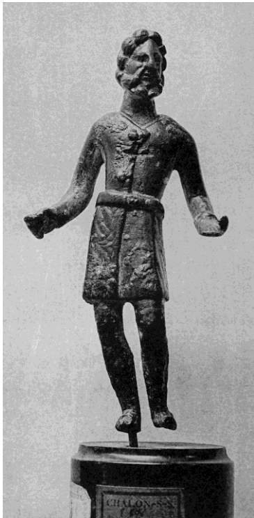
Fig. 5. Sucellus from Chalon-sur-Saône, France. ( Armand-Calliat 1937, pl. XIII )

figurine M14 is part of the stylistic group that forms the basis of this paper it is now missing, thus only the eighteenth-century illustration can be referred to and since only the head and upper torso remained it was not possible to identify which deity it depicted.