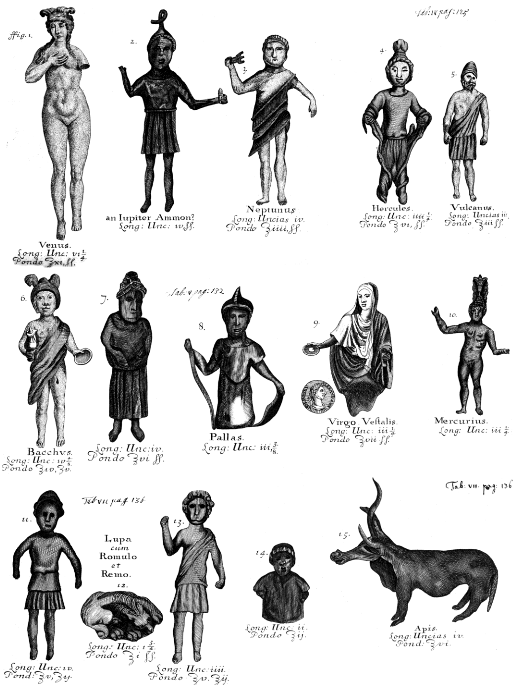
Fig. 2. The Southbroom hoard: Musgrave 1719, tables IV–VII. (Courtesy of the Bodleian Libraries, University of Oxford. Manuscript Gough Somerset 53)