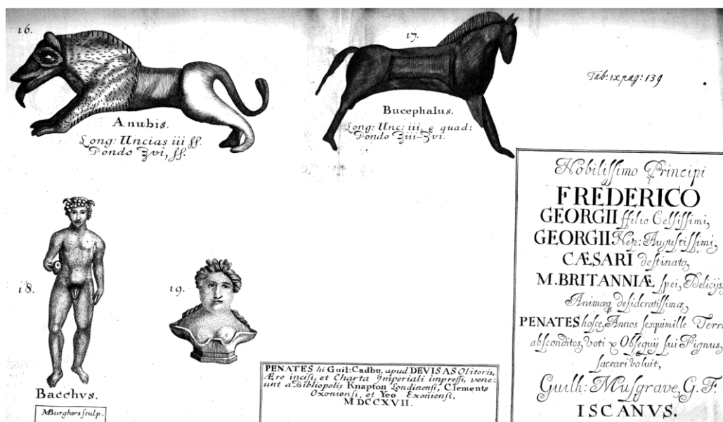
Fig. 3. The Southbroom hoard: Musgrave 1719, table IX.

The missing figurines from the hoard are Venus, Vulcan M5, Mars M10, Bacchus, Genius Paterfamilias, an unidentified deity, three-horned bull, dog or wolf and horse. All of the deities, except the unidentified piece, are typically classical examples of their type and are found on many sites both in Britain and on the Continent, while the three-horned bull and horse are less common. In fact, the three-horned bull is a Romano-Celtic mythological, perhaps divine, creature which originated in Gaul, and there are some 40 examples from that region, particularly in the valleys of the upper Rhône, Saône and Seine rivers in eastern Gaul, while there are seven from Britain. 7 The dog or wolf figurine mentioned above is more unusual and will be discussed further below. A striking aspect of the Southbroom collection is the presence of both highly classical and provincial figures in the same hoard. As George Boon noted, the missing figurines could have been acquired by a collector who valued the classical pieces but rejected the provincial ones. 8 However, while antiquaries may have considered the more native-looking pieces to be of inferior quality, they obviously were regarded highly enough in Roman times to take their place alongside classical figurines.